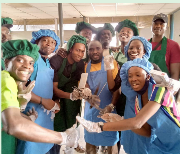
The trainees during a practical session on catfish value addition