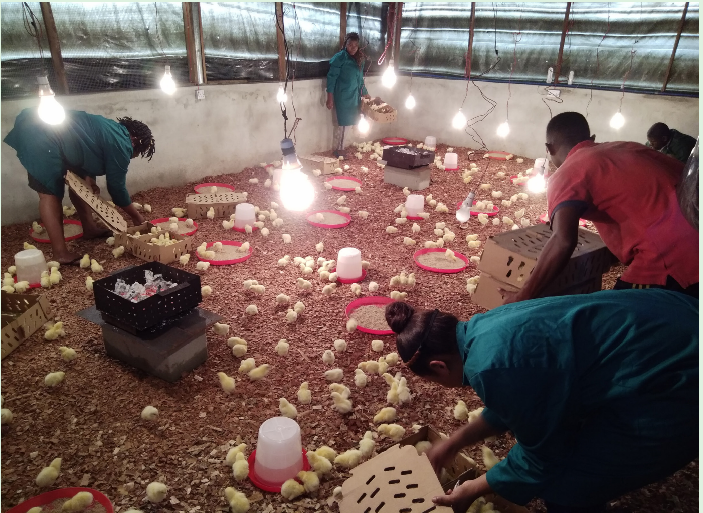
The trained beneficiaries stocking the first set of birds at the agribusiness park in Onne, Rivers state

A team of ENABLE-TAAT trained agripreneurs have recorded over N1million as gross profit, after two cycles of rearing live broiler. They also made 45 percent return on investment in 8 weeks of production. The agripreneurs who constituted a poultry cluster under the TAAT program attributed their success to the technical delivery of ENABLE-TAAT agribusiness park initiative, as well as the backstopping and monitoring activities provided.