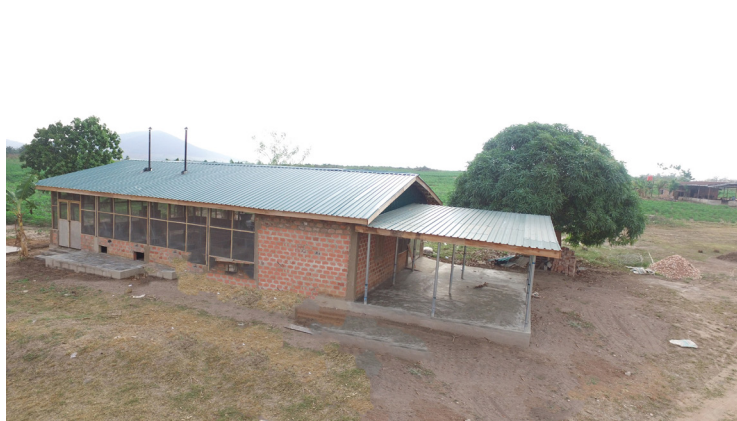
(L-R) Before and after view of the cassava processing centre at Awe