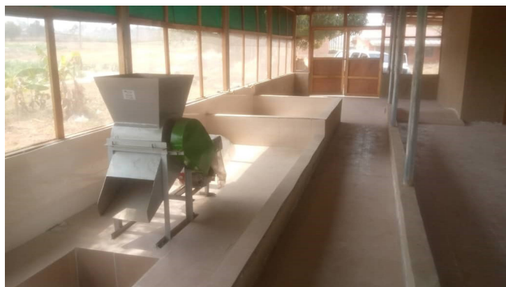
(L-R) Before and after look of a section of the processing centre.