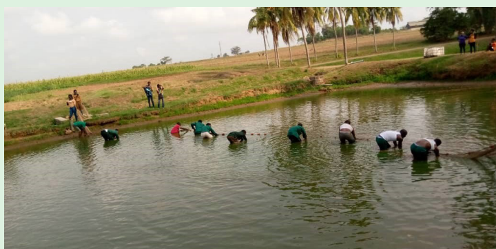
The trainees during a practical session on pond management