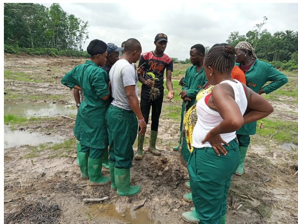
Field practicals with the beneficiaries

When it comes to employment or business opportunities, the youth in the Niger-Delta region of Nigeria mostly look in the direction of the oil industry. It was therefore a herculean task for the IITA Youth Agripreneurs who tried to sell the idea of agripreneurship in the creeks.