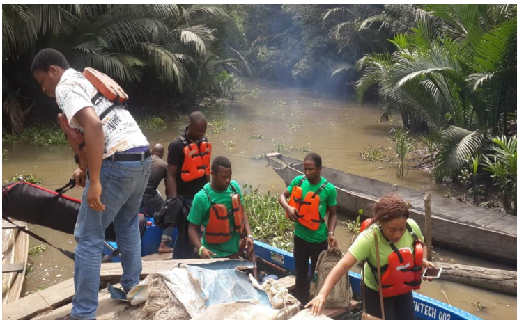
IYA team embarking on the first assessment visit to the creeks in 2016