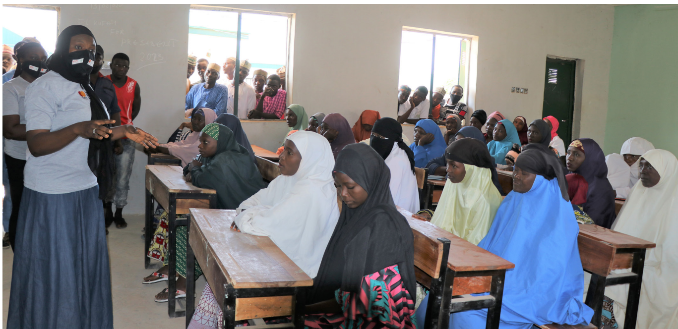
A staff of Young Africa Works-IITA sensitizing women on the need for them to participate in the program

The training program of the Young Africa Works-IITA project is scheduled to kick off on the 1st of February, 2021.