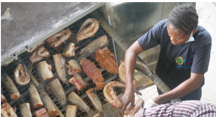
One of the trained youths in Warri producing smoked catfish

The project recorded the start-up of 40 agribusiness enterprises, establishment of two community based cassava processing centres and fish ponds, which are operated by the youths.