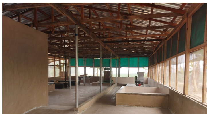
(L-R) Before and after look of the wet section of the processing centre.