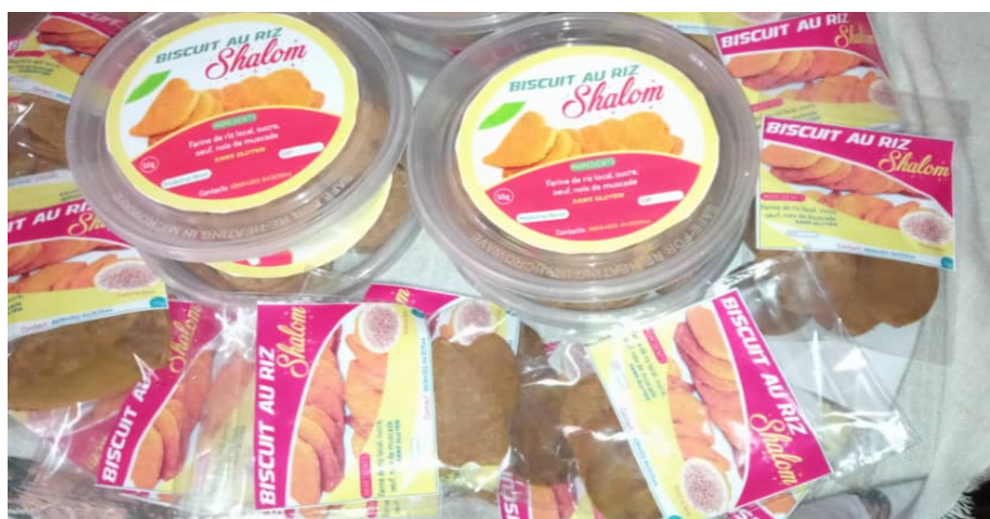
Samples of shalom biscuit