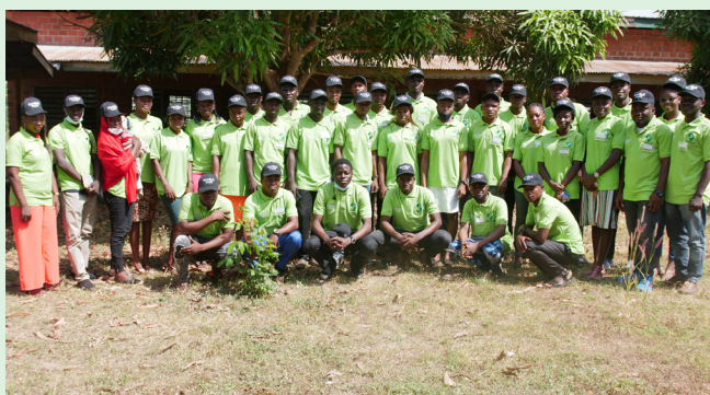
A group photograph of the beneficiaries during their induction at Awe

After training, ENABLE TAAT offers mentorship and backstopping to its beneficiaries. The compact also links them to loans and grant opportunities.