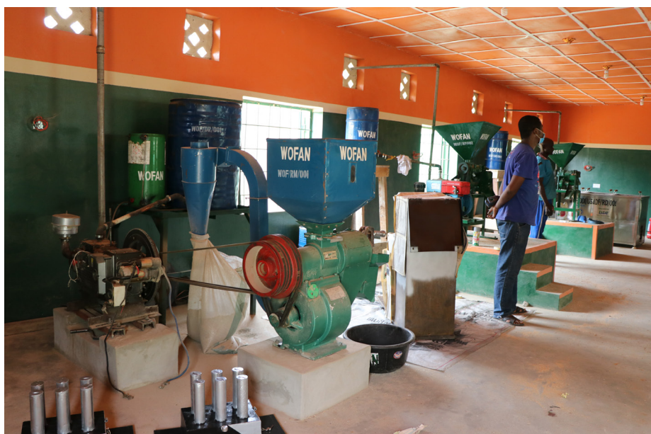
Some of the machines used for teaching women on value addition at the centre

The company is still aiming at training of local farmers in animal feed production, crop production such as rice, sorghum, maize, millet, groundnut, and soybeans. It also aims to change the negative attitude of people toward modern ways of agricultural activities and its production.