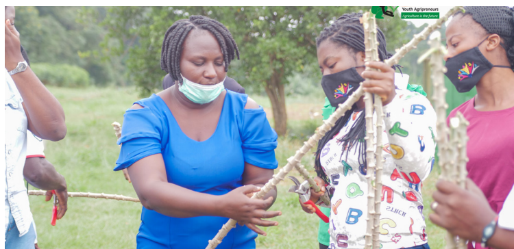
(L-R) IYA trained agripreneurs taking new trainees through the process of cowpea and cassava production