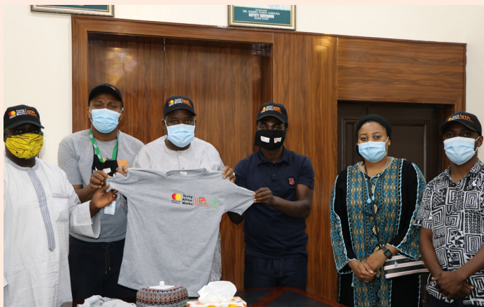
The Young Africa Works-IITA team with the Deputy Governor of Kano State, Dr Nasiru Gawuna (M) during a familiarization visit to the government of Kano.