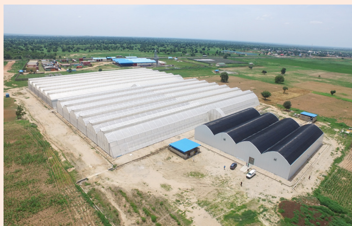
A bird eye view of the internship centre for horticulture production