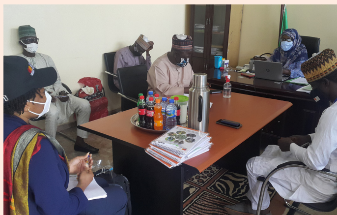
The team during a visit to the Commissioner for Agriculture in Kaduna State, Hajiya Halima Lawal