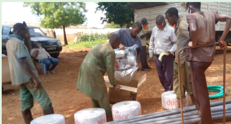
ENABLE-TAAT liaison trainees receiving the items from the Makeuni government officials

The compact was supported with input such as screen house, and water tanks to boost irrigation activities to further strengthen its activities for expansion.