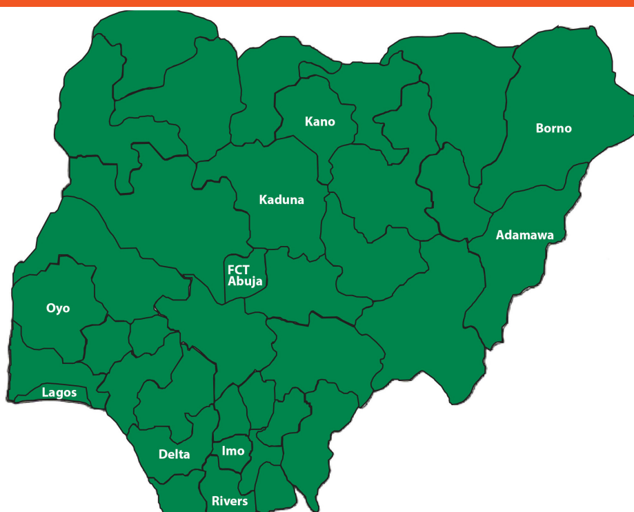
A map showing locations where IITA currently operate Youth in Agribusiness projects in Nigeria

the focus states will lead to a massive out-scaling of the STEP program.