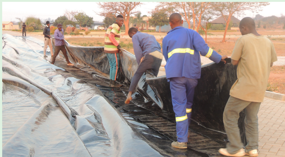
Youths constructing a fish pond

poultry business were supported with 1000 birds and poultry accessories for the establishment of broiler production enterprise. These trainees identified a poultry facility which could be leased to them for the purpose of this business right after the training. They acquired knowledge in the production, value-addition (smoking) and marketing of chickens as their business will focus on sale of live broilers and value-added smoked chickens.