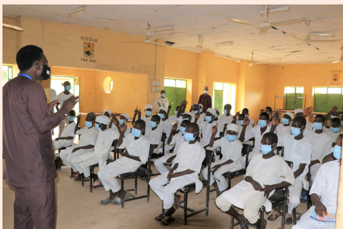
The team introducing the STEP component of the projects to students in secondary school