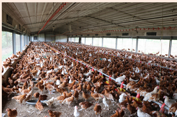
A potential internship poultry facility identified in Epe, Lagos state