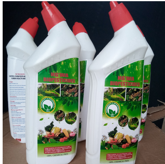
Some samples of the pesticide