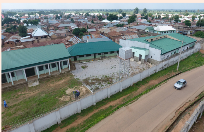
A bird's eye view of an identified training facility at Makarfi, in Kaduna State