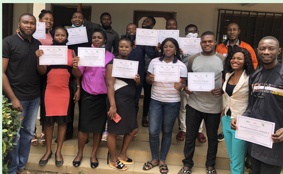
Some beneficiaries of ENABLE-TAAT in Imo state