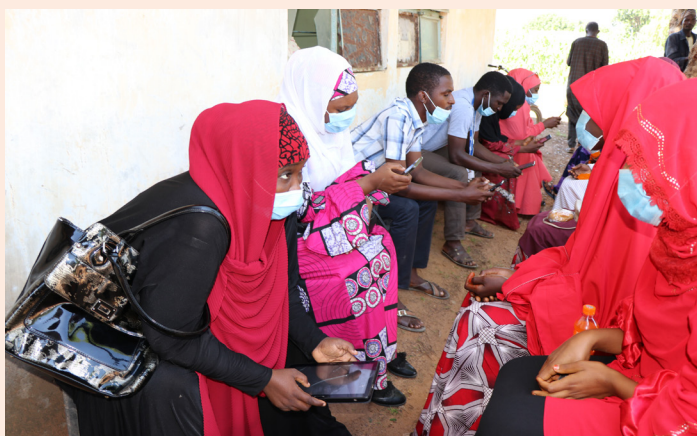
Women participation is crucial in the project. The team conducting orientation for women