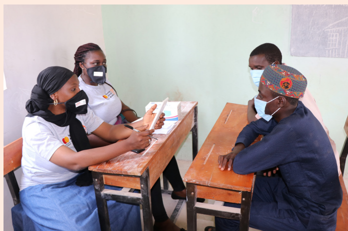
Understanding the needs of beneficiaries of a project is essential. The team conducted a baseline survey to identify needs and design strategies to meet the demands