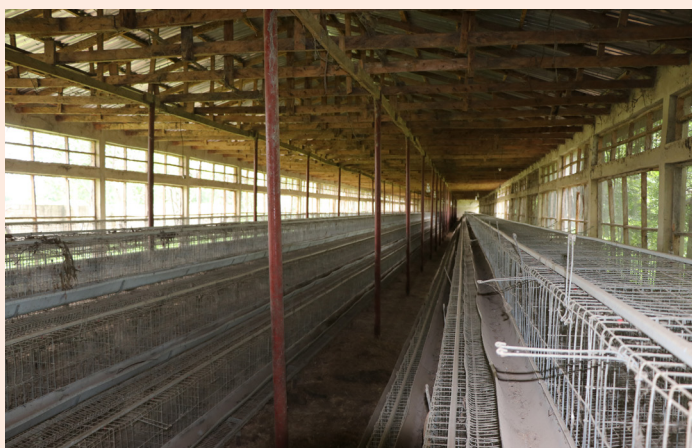
During the baseline survey, the team also identified facilities that could serve as training and internship centre for the youth. This is a 10,000 capacity poultry which will be utilised for the training in Kano state