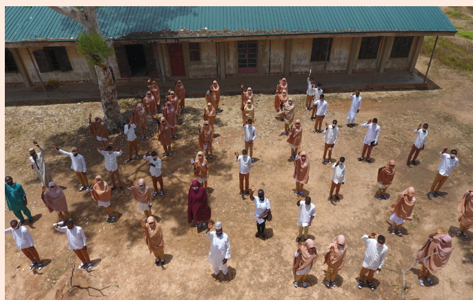
We are catching them young and that is why we are engaging secondary school students in agriculture at an early stage