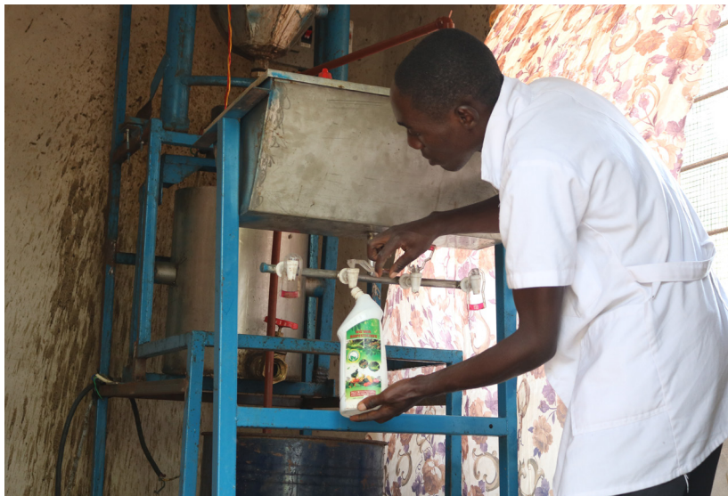
A busy factory staff of Ng'wala Inventions Limited