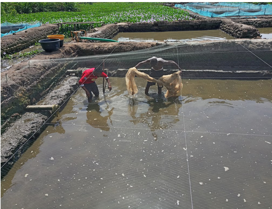
Some of the trained CYAG youth working at their fish pond

Youths trained under the Community Youth in Agribusiness Group (CYAG) project received start-up funds to commence their own agribusiness enterprises. CYAG project, which is funded by Chevron Nigeria Limited (CNL) as part of the company's Corporate Social Responsibility (CSR), is targeted at harnessing the energy of the youth in the Niger-Delta region of Nigeria for agribusiness.