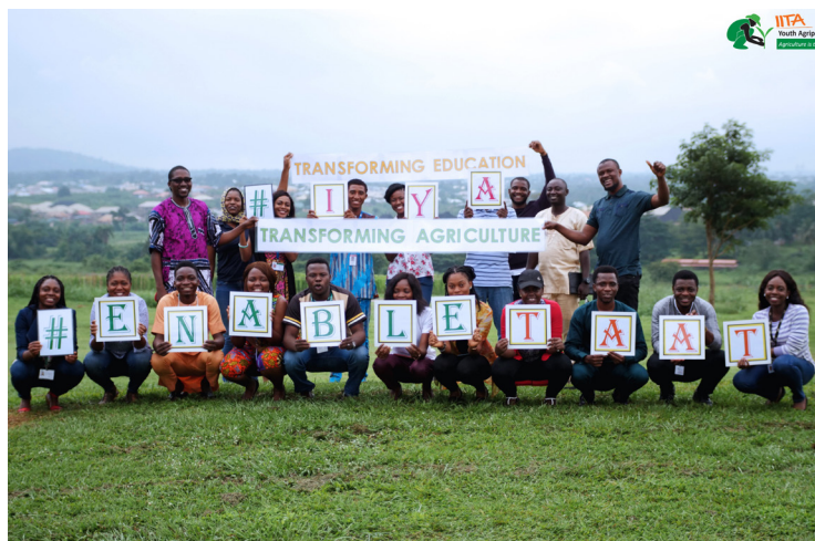
In celebration of 2019 International Youth Day