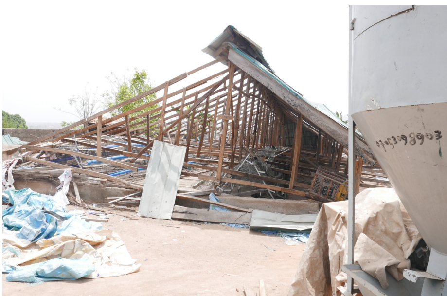
Agroved structure after the rainstorm

would have mitigated their loss, but unfortunately, they had none. The good news, however, is that the trio have moved on after drawing lessons from the disaster and taking steps to address the risks involved in the business.