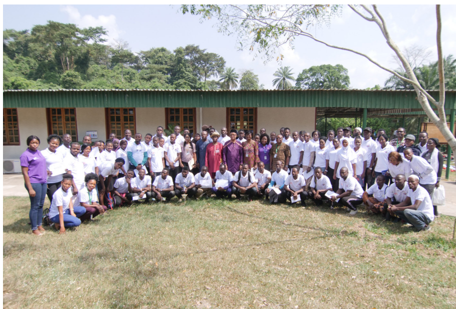
A group photograph of the trainees and project staff

The project is expected to empower a thousand youth resident in rural areas in the Republic of Benin (Lokossa and Cotonou) and Nigeria (Oyo and Ekiti). In the project's first year, youths from the aforementioned locations, were trained on the value chains of Moringa, soybean/ cowpea, maize, plantain, mango, cassava, rice, catfish, and agriculture-machinery fabrications. At the end of the training, they were awarded start-up kits after developing bankable business plans vetted by experts.