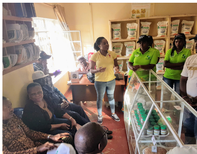
Visit of TAAT steering committee to ENABLE-TAAT sales outlet in DR Congo