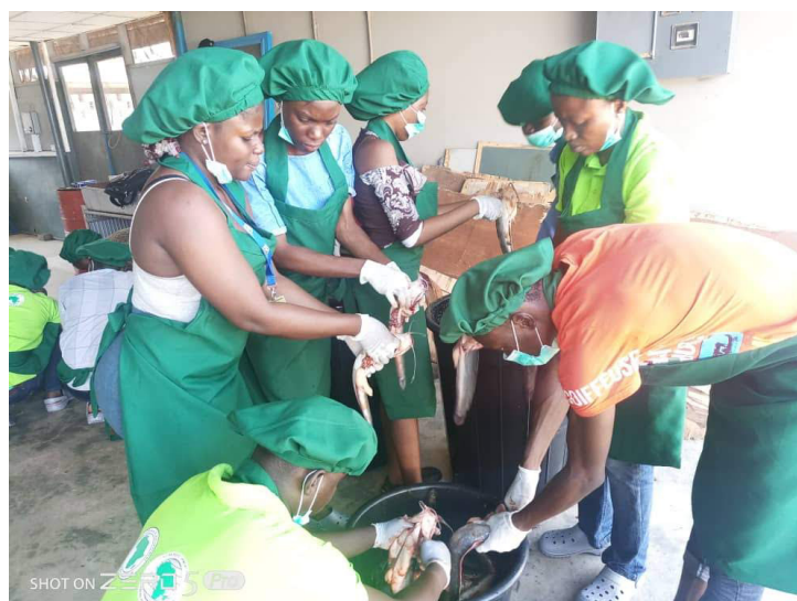
The interns during a practical session on fish smoking