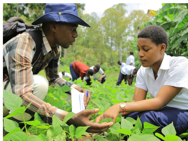
The Start Them Early Program (STEP) was launched in Nigeria in 2019