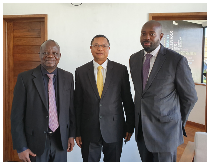
Representatives of IITA and the Minister of Agriculture in Madagascar

In Madagascar, the first batch of youths who completed their incubation program under the pilot phase of the ENABLE Youth Program received