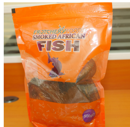
A close shot of the branded fish pack

Another feat recorded in year 2019 by Frotchery Farms Limited was the re-branding of its product as well as the introduction of a new packaging of international standard. The cost of re-branding the product was facilitated through the support of an angel investor.