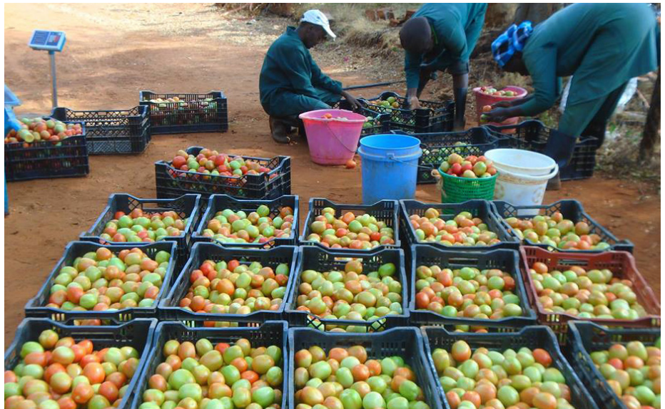
Some KHYG sorting tomatoes harvested from their screenhouse

The successful applicants will pay back 25,000 shillings monthly throughout the period specified for repayment.