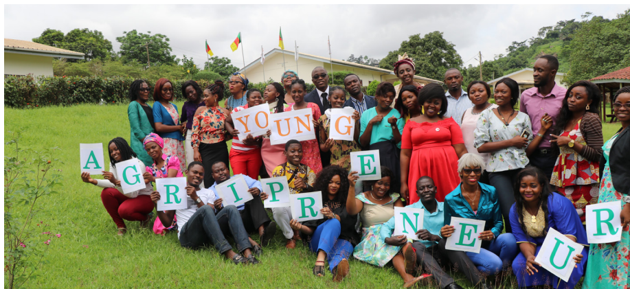
A cross section of the first batch of the selected Agripreneurs

After that, a panel made up of representatives from IITA, the Agriculture Value Chain Development Project (AVCDP), Youth Agribusiness Incubation Center (YABIC), YABIC host institutions, and MINADER interviewed the candidates and came up with 512 finalists.