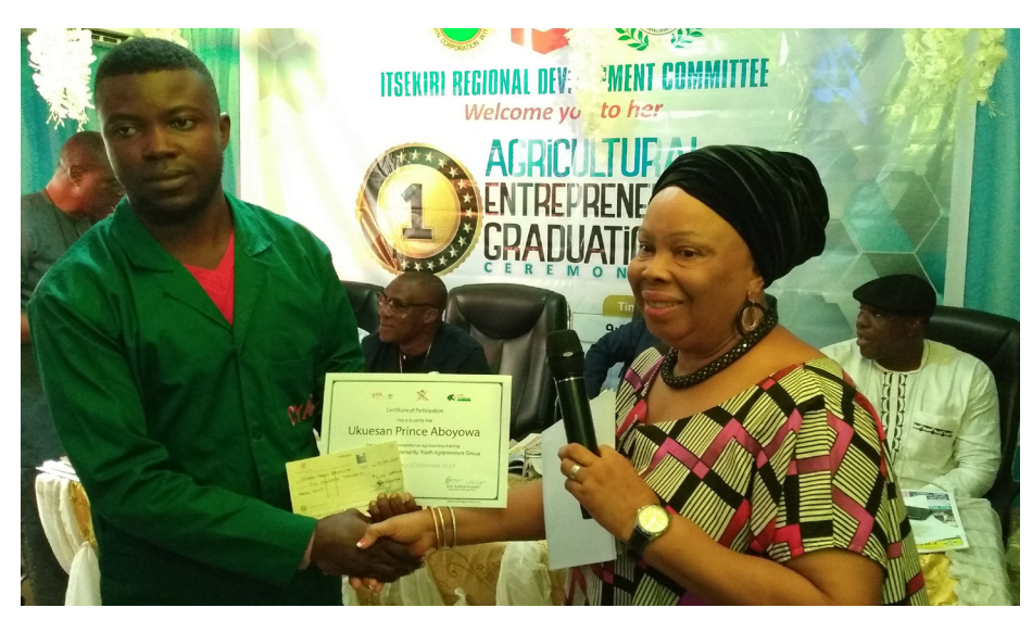
One of the trained youth receiving certificate of participation and cheque for start-up grant from Chevron Nigeria Limited.

The CNL boss, however, hinted that another set of 40 agripreneurs would soon commence training to cater for youths from other Itsekiri communities in order to churn out a large crop of entrepreneurs in agriculture who would help generate more value in the communities.