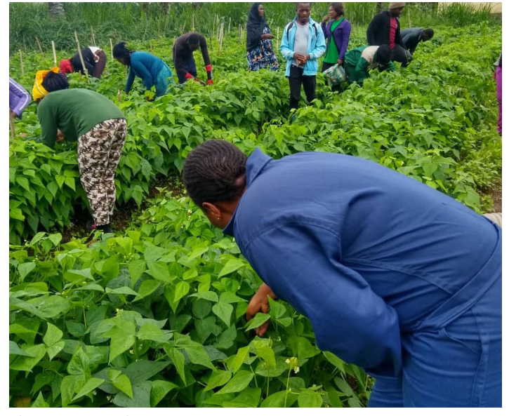
The Agripreneurs harvesting green peas

After weeks of trainings, the aspiring agripreneurs trained by ENABLE Youth Cameroon (EYC) in Ferme Ecole de Ndoungue , one of the Youth Agribusiness Incubation Centers (YABICs) have initiated pilot enterprises.