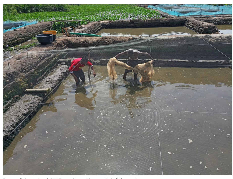
Some of the trained CYAG youth working at their fish pond

The beneficiaries were trained in the value chains of cassava, plantain and aquaculture in partnership with PIND