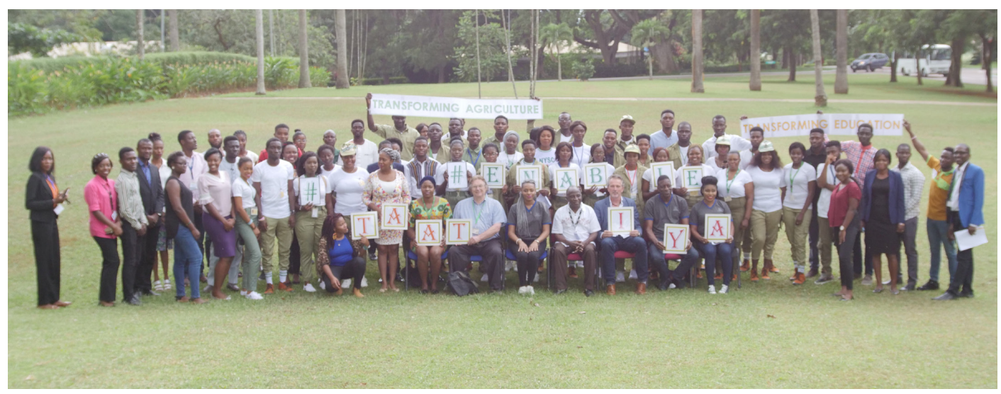
A photo session with participants at the International Youth Day

On August 15, all roads led to the International Institute of Tropical Agriculture (IITA) as the ENABLE-TAAT compact in partnership with the Business Incubation Platform (BIP) of IITA and Nestle Nigeria Limited, organized an enlightening program for youth to commemorate the 2019 International Youth Day (IYD).