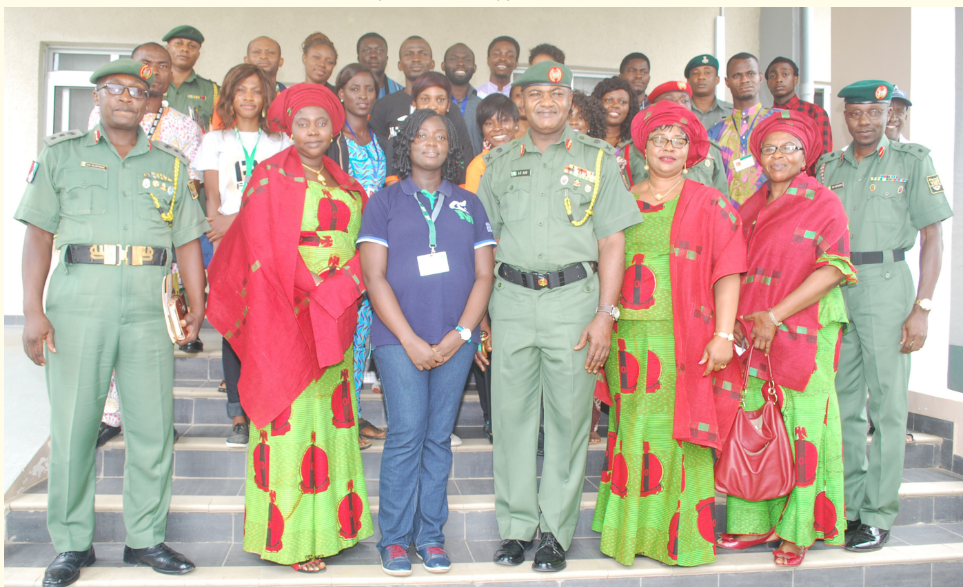
Major General Laz Ilo (M) with some army officers' wives during their visit to IITA Youth Agripreneurs' office

available along the agricultural value chain.