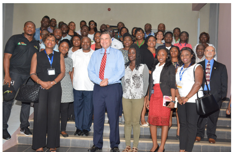
The Ambassador (middle) in a group photograph with Agripreneurs and delegates from Cote d'Ivoire