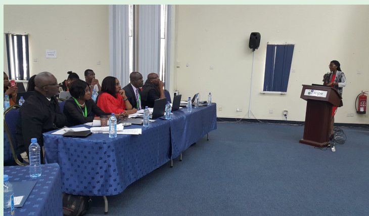
An Agripreneur from Tanzania pitching her business plan to the panel of judges