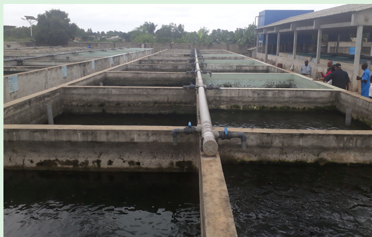
The cross section of a concrete pond at one of the institutes visited

The aquaculture compact led by WorldFish in partnership with ENABLE-TAAT compact implemented by IITA Youth Agripreneurs will support fish breeders with improved tilapia and catfish brood stock strain to increase the current fish production in Republic of Benin, train and support farmers on formulation of low cost fish feed to reduce cost of production, train the farmers and youth on value addition to address post-harvest losses etc.