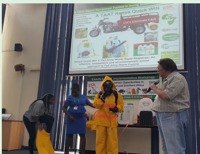
A stage display on the fight against Fall ArmyWorm