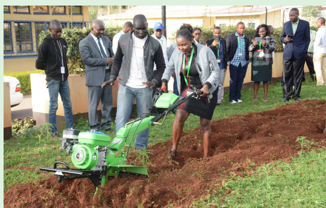
A display of some of the mechanized tools