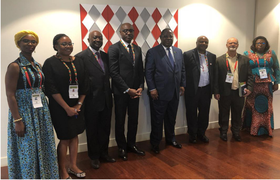
The Prime Minister (4th from right) with some of his cabinet members and delegates from IITA

The Prime Minister of the Republic of Gabon, H.E. Emmanuel Issoze-Ngondet is exploring partnership with the International Institute of Tropical Agriculture (IITA), in the areas of youth engagement in agriculture.