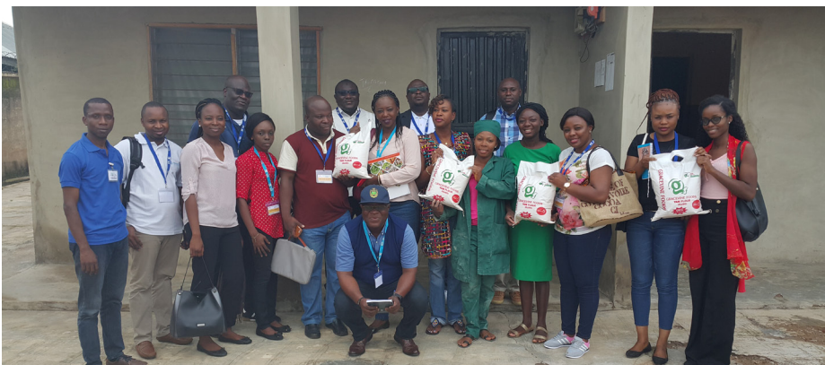
The delegates during a visit to one of IYA's spin-offs, Gracevine Foods

The second incubation model is intended for youths who already have existing businesses. The incubation