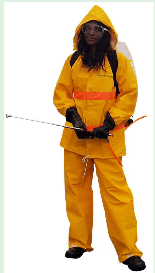
A youth who is fully kitted to fight Fall Army Worm