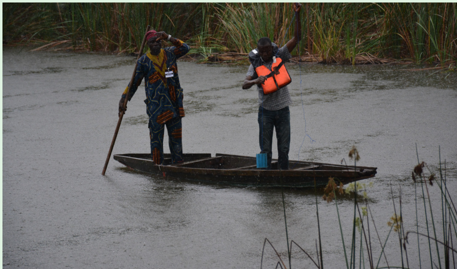
The assessment exercise at IITA

The TAAT aquaculture compact in September conducted an assessment exercise on the reservoir at IITA for the construction of cages to implement the Tilapia Cage Culture technology being proposed by the compact.