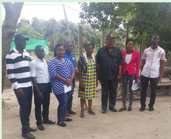
A group photograph of the team who conducted the assessment exercise.