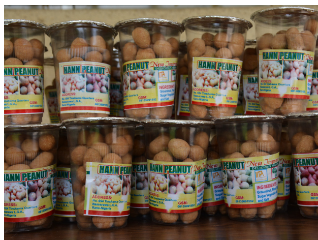
The Hann peanut snack