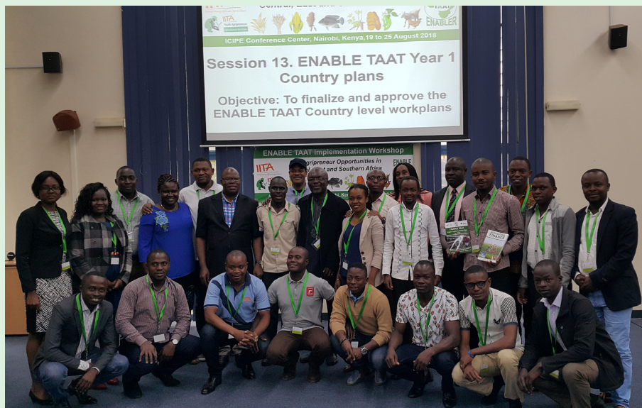
Facilitators from EKIMIKS Nigeria Limited and the selected businesses

The ENABLE TAAT project is supporting the establishment of twenty three more independent agribusiness enterprises.