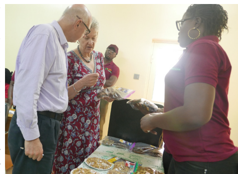
An Agripreneur interacting with the delegates from USAID at an exhibition organized during the visit