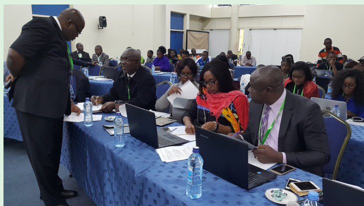
The Judges brainstorming on the business plans