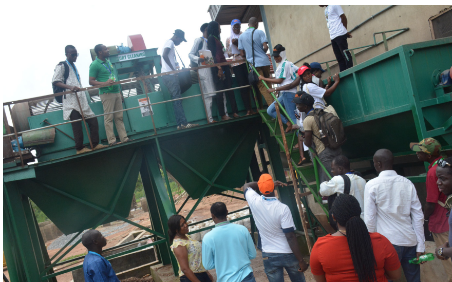
The Senegalese youths during a visit to Kofo AgroAllied Farm at Iseyin, Oyo State

The second week was facilitated by the IITA Youth Agripreneurs, where representatives of IYA presented an overview of IYA's model, and conducted an educational visit to successful agribusiness enterprises in Oyo State among which was Kofo AgroAllied Farm, a cassava processing farm. The educational visit also included some of the businesses established by trained youths under the IYA incubation program.