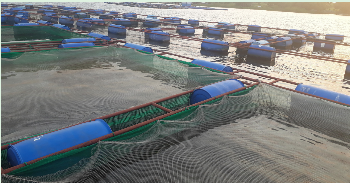
Some of the cage culture facilities discovered during the assessment exercise

In a bid to implement the aquaculture compact of TAAT in the Republic of Benin, representatives of WorldFish and IITA Youth Agripreneurs visited the country between 28th and 29th of August to identify strategies of upscaling the fish farming activities in Republic of Benin and conducting an assessment exercise on aquaculture facilities in the country.