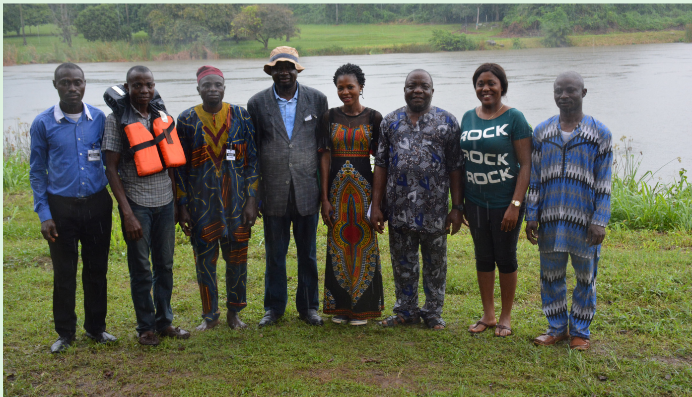
The team who conducted the exercise

The methodology of the training will see the aquaculture compact handling the technical aspect of the training of the selected youth and farmers through the ENABLE-TAAT Compact. The Aquaculture Compact will provide the technologies and carry out the demonstration of the technologies, while The ENABLE-TAAT compact will empower the youths to set up aquaculture business initiatives.