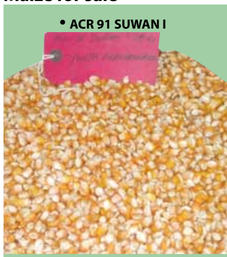
• ACR 91 SUWAN I