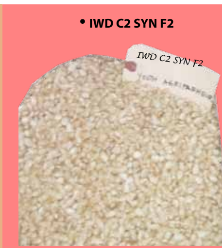
• IWD C2 SYN F2