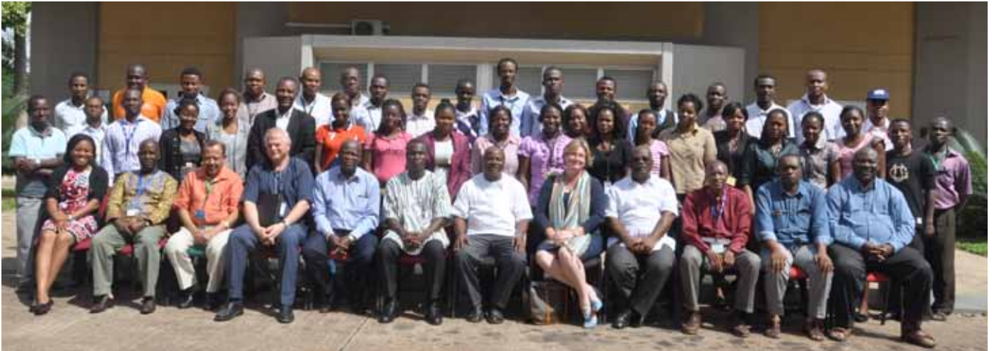
Young Agripreneurs at the retreat in Ibadan.