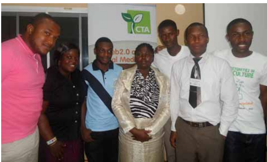
IYA members in photo at Web 2.0 training

During the workshop, participants were able to establish communication