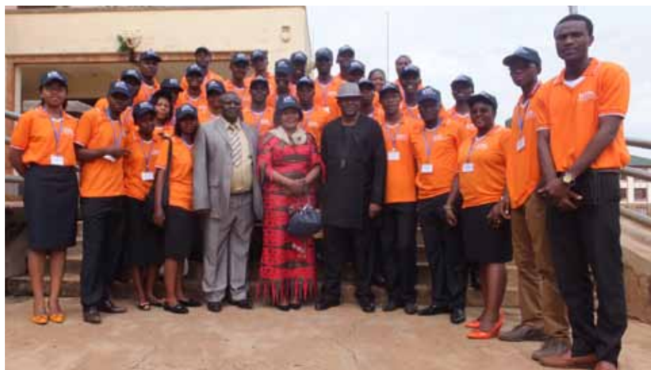
Young agripreneurs in DR Congo.