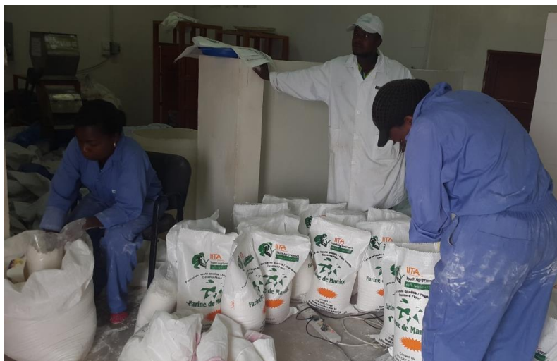
IKYA team producing High Quality Cassava Flour

Opportunities are opening in other areas as well. The Catholic Diocese offers the group 24 ha for extending its vegetable and cassava production. Two large abandoned fish pond networks were discovered at Myakabere and Lwiro and are being converted to modern production of catfish. To reduce costs the group produces its own feed from locally-sourced ingredients. IKYA