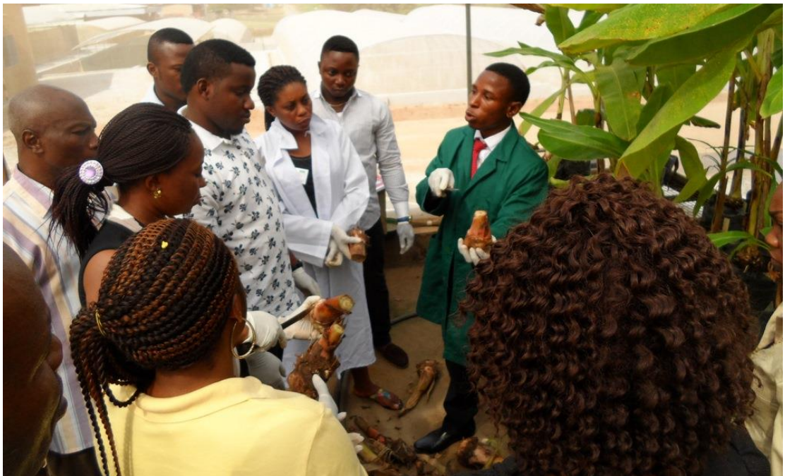
An Agripreneur conducting training on plantain sucker multiplication

effort represents mainstream training that leads to the establishment of independent agribusiness. To date, 134 such businesses were started and IYA has started to track their success. Most of these businesses are small enterprises providing inputs and services to other farmers, but some are medium scale farming and food processing businesses.