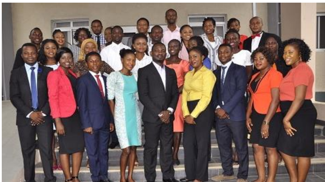
A group photograph of IYA Core Staff at their headquarters in Ibadan, Nigeria.