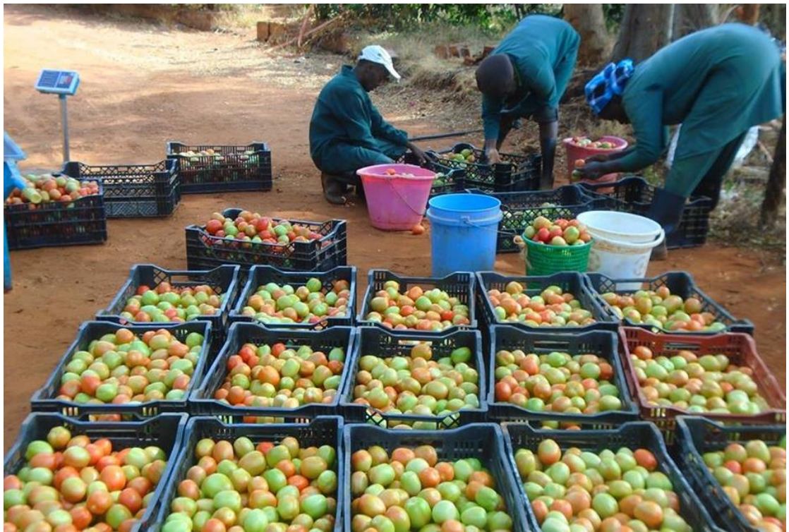
KHYG sorting harvested tomatoes from the greenhouse for sale