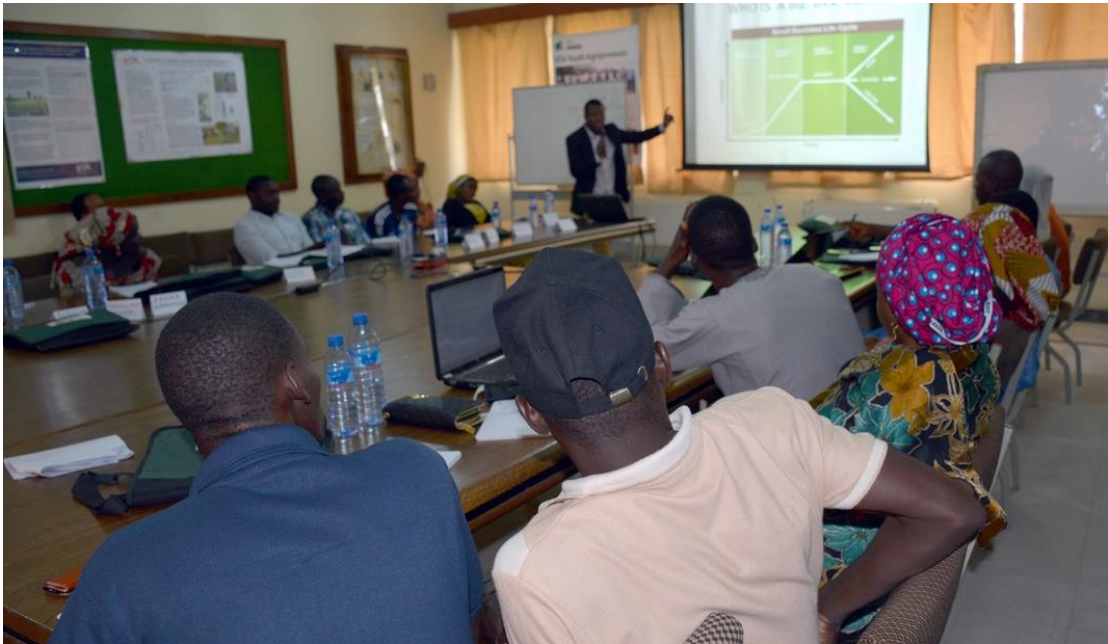
Classroom training for the beneficiaries of the N2Africa, Borno Project in Kano, Nigeria