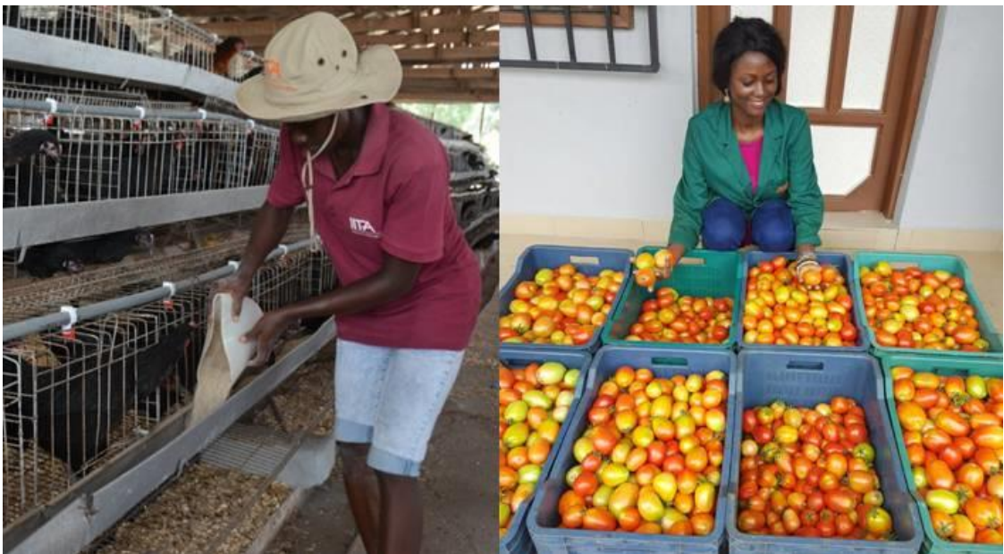
Imo Agripreneur with crates of tomatoes from the greenhouse (left) and another tending to layers in the poultry house (right)

The successful effort by Agripreneurs in Imo has shown that empowered youth can succeed at agricultural enterprises where others have failed. By assuming control of and rehabilitating abandoned facilities, start-up costs are minimized. Much of Imo State is urban so market demand is high but consumers have rather exact preferences, rejecting some