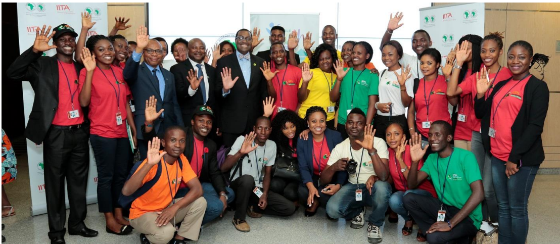
Some selected IYA members across Africa during a visit to AfDB headquarters in Abidjan

difficult to discover because of their embarrassing past failure and deteriorating condition, but once accessed they are quickly appraised, cleaned, business strategies formulated and returned to production. IITA expertise is crucial to this successful transition. Such facilities were discovered in DRC, Kenya and Nigeria, and more will doubtless emerge. In some cases, the facilities are clustered; as when greenhouses, fish ponds and poultry pens are found in the same general areas, and their operations assigned to different groups of youth opting to specialize in their respective agribusinesses. Rehabilitation may achieve an additional dynamic as when 1) new facilities are constructed next to rehabilitated ones, 2) youth depart to begin their own similar businesses elsewhere, and 3) additional under-performing facilities are offered to youth, either as groups or individuals, based upon growing awareness of their success elsewhere. Under the best of situations these rehabilitated facilities can transition into youth agribusiness parks described above.