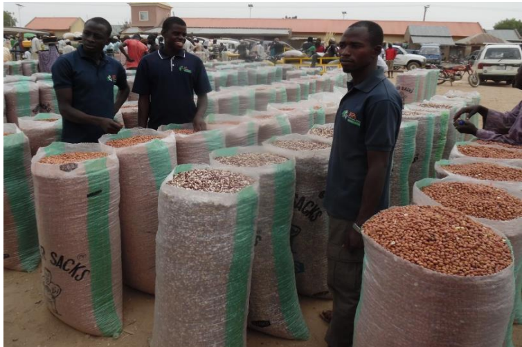
Borno Youth Agripreneurs at a sales point for their produce

These agribusinesses include farm input supply, grain legume trading and processing, and providing pest control services. Trading alone accounted for 155 tons of produce in 2016. These youth have attracted the attention to an Anchor Borrowers Program to further grow their businesses. Business start-up, profits and assets by these youth-led enterprises has reached about $510,000. Profitability of these