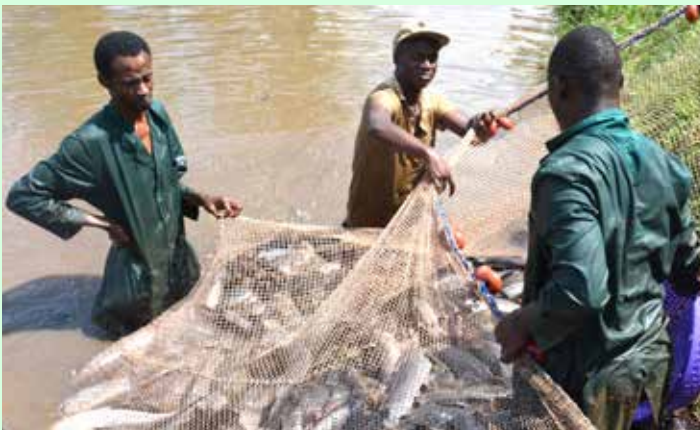
The team harvesting catfish for sale in one of the ponds.