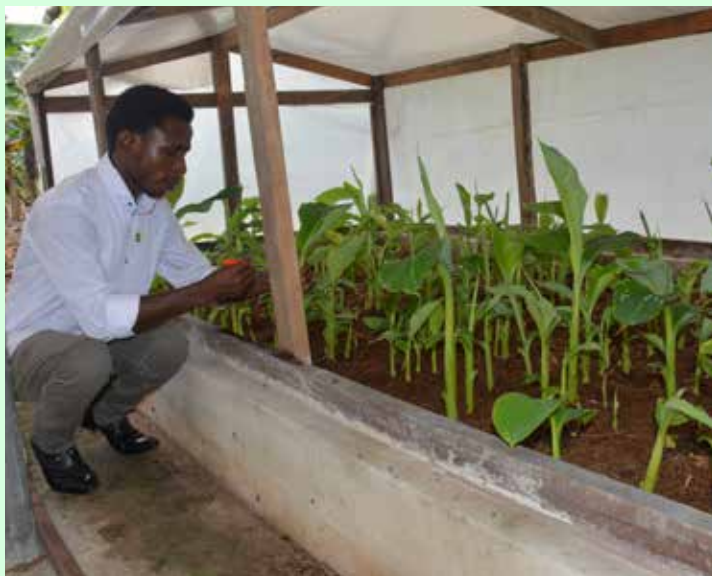
The Onne team are well known for producing disease-free plantain and banana suckers for farmers. Using the macro-propagation technique, they have a constant supply to meet demand.

IYA Onne was established in 2016. The team was deployed to IITA station in Onne from Ibadan to develop profitable agribusiness enterprises that can be scaled-up to a commercial level and also plan and implement training programs for youth in the South-South region of Nigeria. Their activities cut across cassava, capacity development, fishery, livestock, plantain and banana.