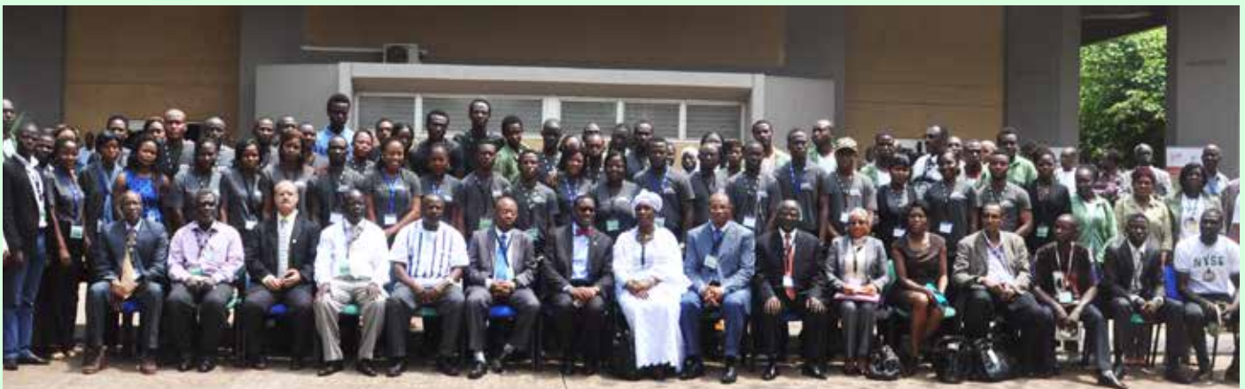
Dr Adesina with participants during the conference.