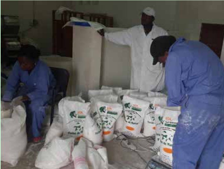
The DR Congo team packaging their High Quality Cassava Flour (HQCF) for sale.

IITA Youth Agripreneurs-DR Congo was established in Kalambo, South-Kivu Province in November 2013. It's major enterprise includes production and export of High Quality Cassava Flour to nearby countries. The team makes use of 40 abandoned fish ponds in Lwiro and Nyakabera for fish production. IITA Youth Agripreneurs-DR Congo has been replicated in Kinshasa and Kisangani.