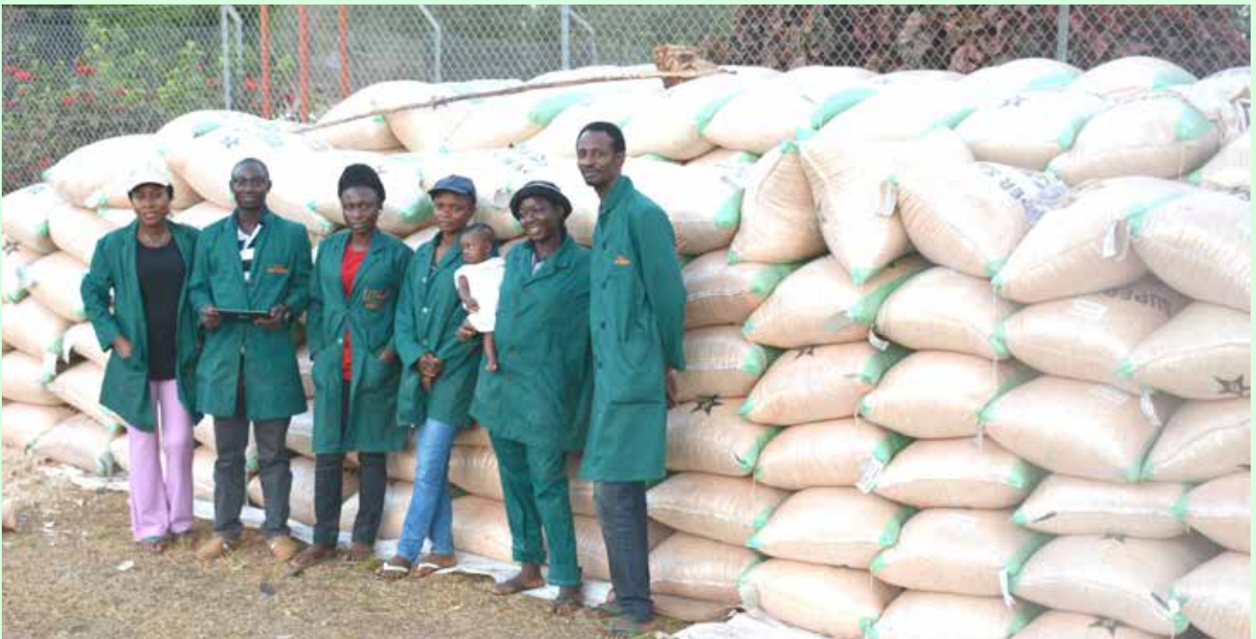
Agripreneurs with the bags of their first harvest of soybean and maize from the field in Mokwa, Niger State.