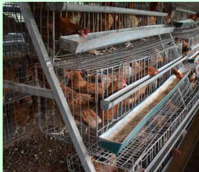
They are into poultry and egg production from 1500 capacity poultry.