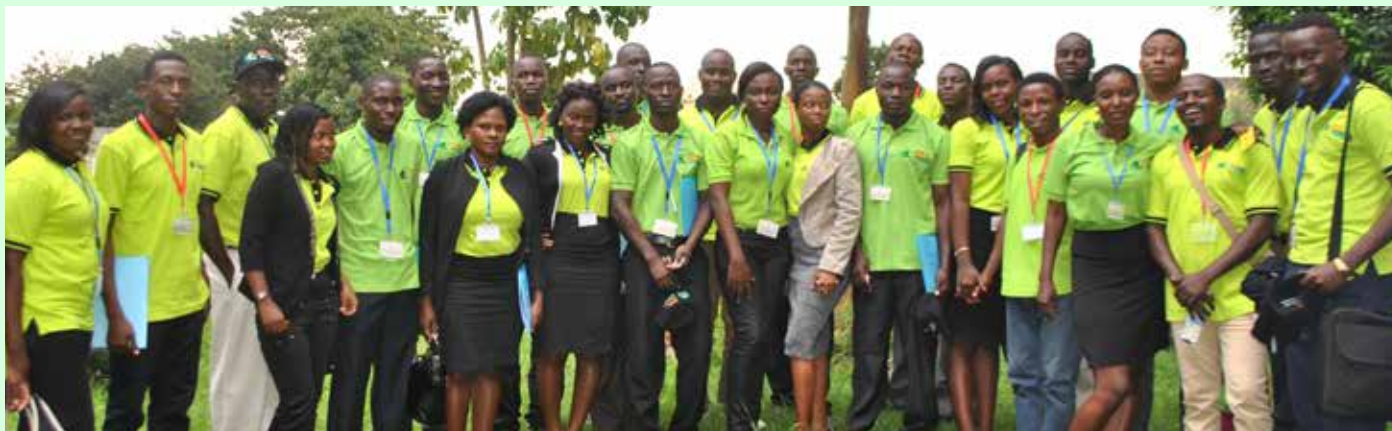
A group photograph of the Uganda team.