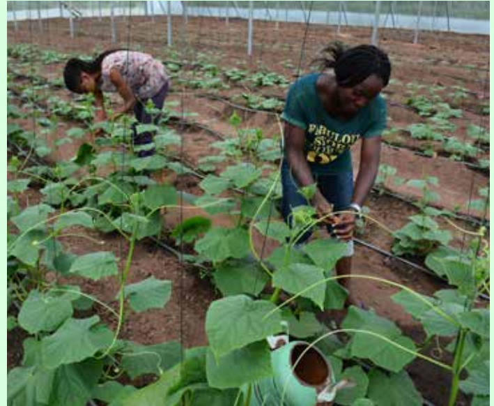
The Agripreneurs working in the greenhouse.