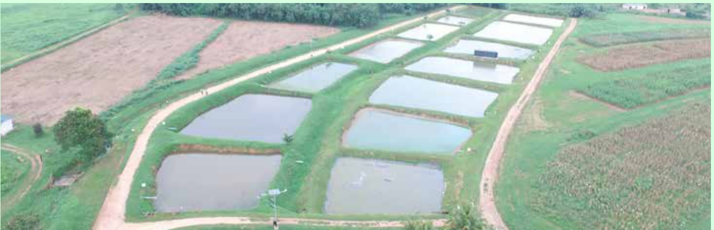
A bird's-eye view of IYA fish ponds.