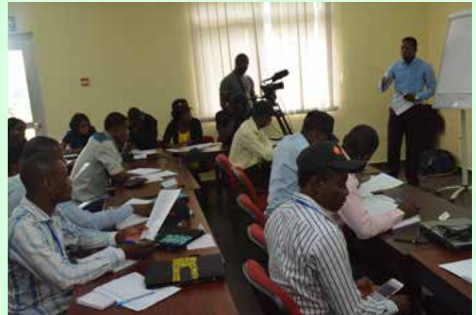
Classroom training for the beneficiaries of the project.