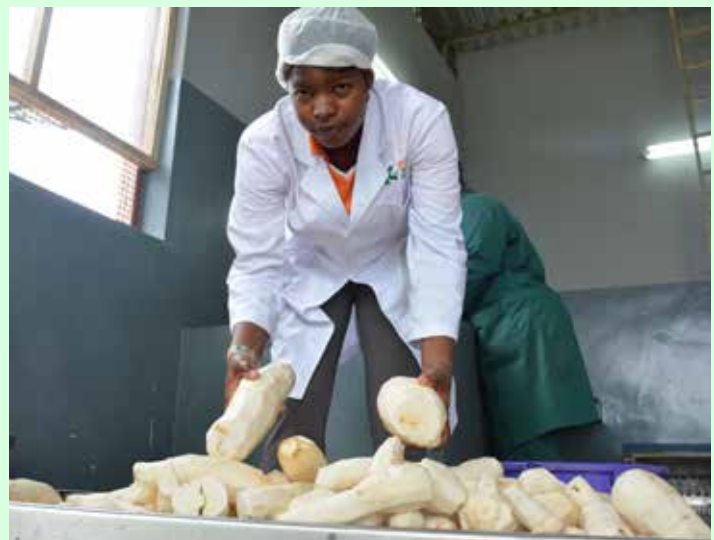
Neatly peeled cassava roots to be processed into garri.