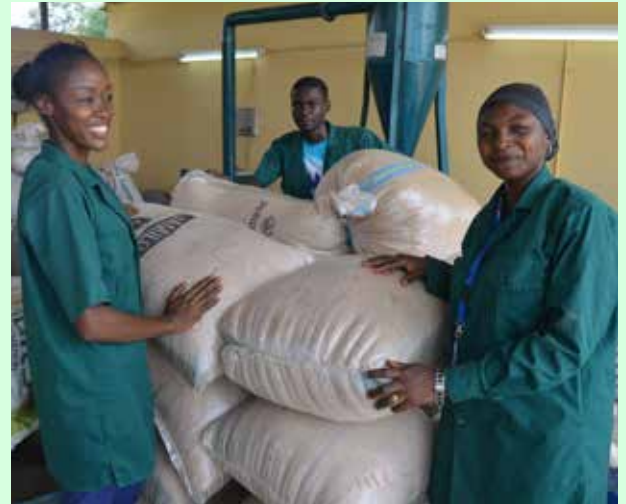
Some Agripreneurs with the harvested bags of sorghum.