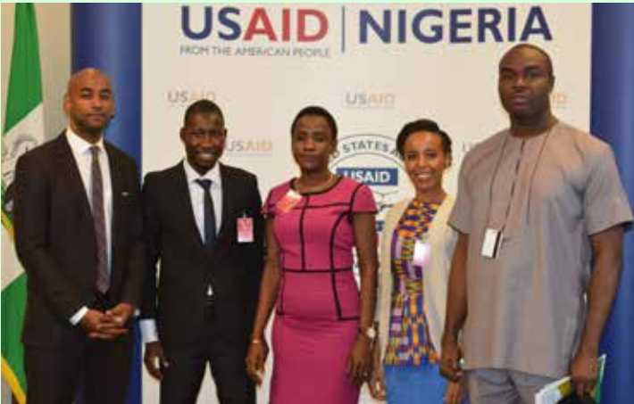
The Project Manager-(2nd from left) with partners of the project.

The youth who are trained under this project are to develop business plans that will enable them to access loans for the purchase of the smart tractor for commercial use. The tractor has a GPS which connects the tractor operator to the farmers.