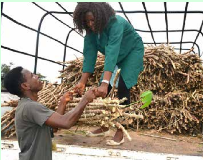
The cassava team also produce quality planting material for farmers.