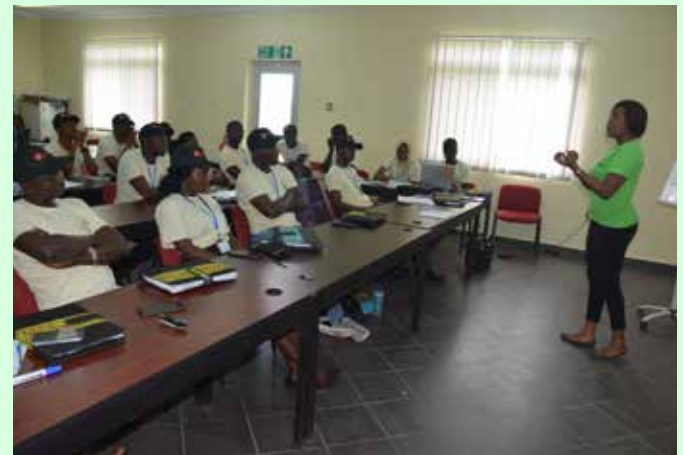
An Agripreneur facilitating a session on strategic marketing.