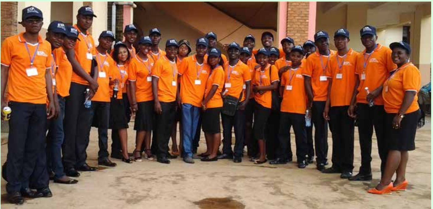
A group photograph of the team in DR Congo.