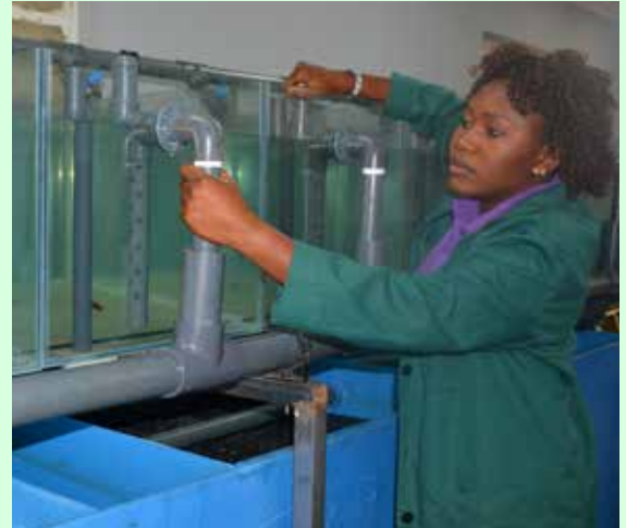
The state-of-the art hatchery facility constructed for the production of fingerlings.