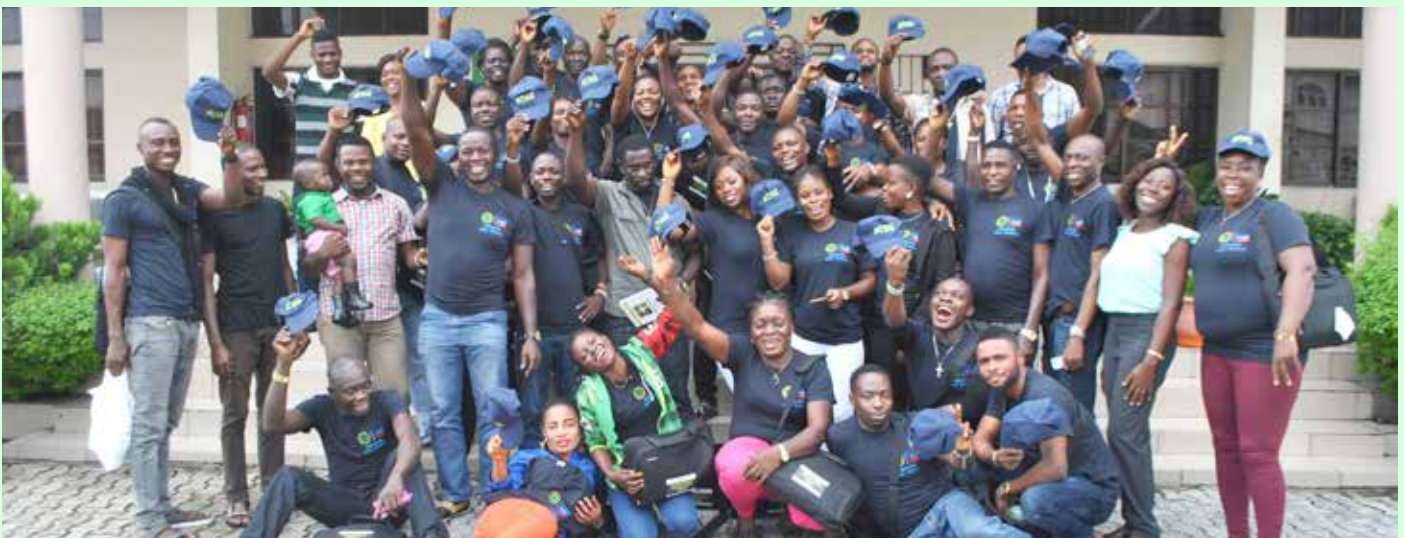
A group photograph of the first set of trainees under the project.