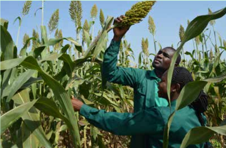
The team in one of the fields in Nassarawa.

IYA Abuja was established in 2014 to reach out to the youth, policy makers, and stakeholders in the North-Central region of the country. They produce sorghum, rice, maize, cassava, and fish. They also add value to some of the commodities.