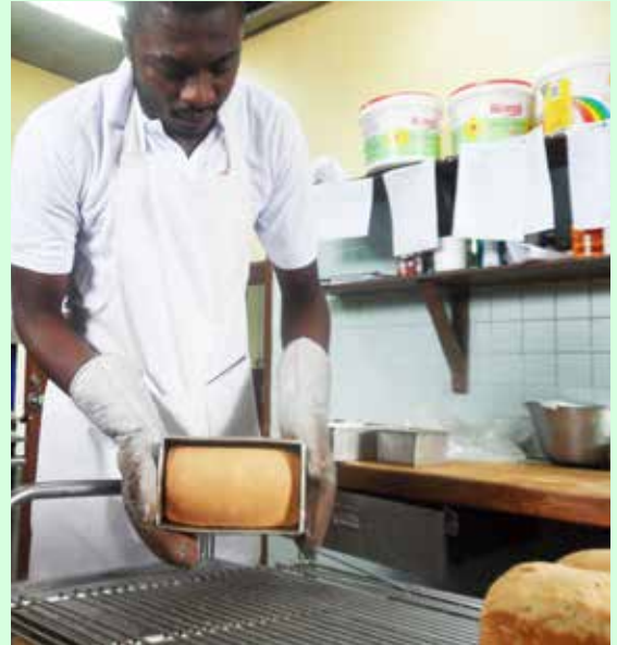
An agripreneur baking bread with High Quality Cassava Flour.