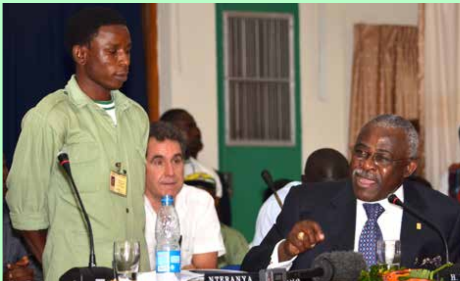
Dr Kanayo Nwanze admonishing a serving youth corps member to embrace agriculture as a viable means of employment.

In August 2012, IITA gathered a team of young unemployed graduates and challenged them to explore the opportunities inherent in agriculture. The graduates who were from diverse academic backgrounds were trained, mentored and coached by IITA and other partners. These have however, evolved and given birth to a movement changing the narrative about agriculture.