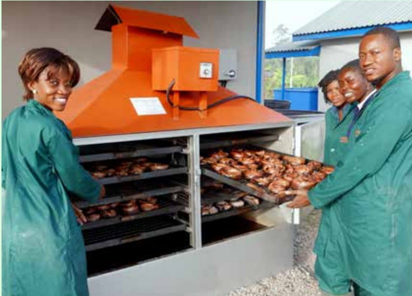
The team adding value to fresh catfish through smoking using the smoking kiln.

The Processing team of the group add value to some commodities produced by the team. Adding value reduces postharvest losses and increases the income of the Agripreneurs.