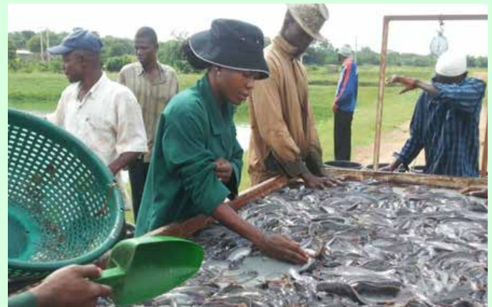
The team sorting the fish to be stocked in the ponds.