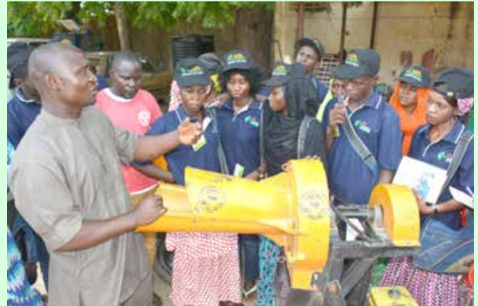
The Borno Youth being trained on machine fabrication.