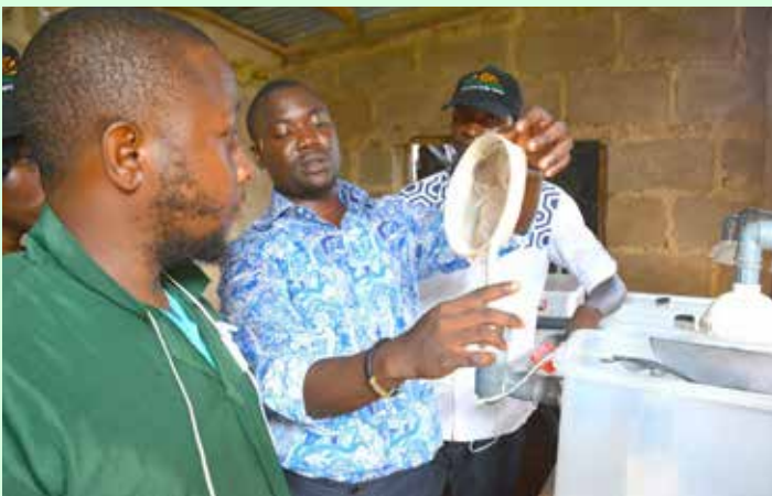
Practical sessions for the trainees on fish farming.