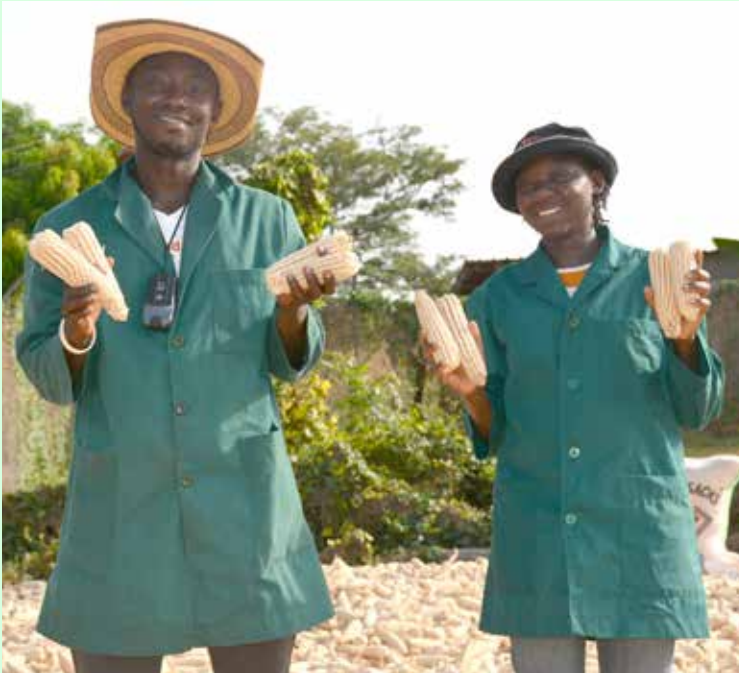
The team in Mokwa, Niger State showcase the harvest from their field.

Venturing into the production of seeds and grain for maize, soybean, and cowpea, Agripreneurs moved to the northern part of the country to establish large hectares of land for the production of these commodities.