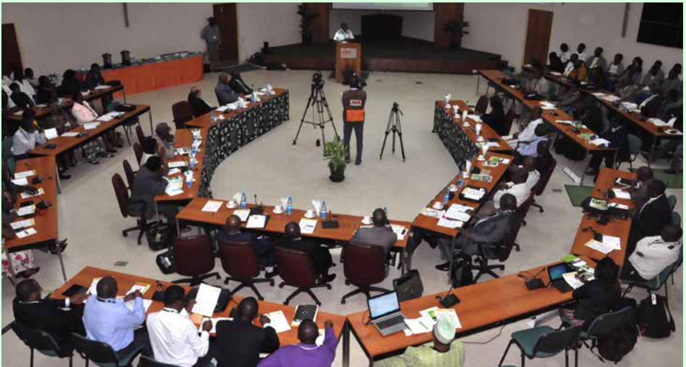
Cross-section of participants at YADI conference.

In May 2014, a conference known as "Youth in Agribusiness Development Initiative" (YADI) brought together stakeholders in the agricultural sector to address ways of engaging youth in agribusiness. The concept note that was developed during the workshop gave birth to the ENABLE Youth Program. Through the ENABLE Youth program, the IYA model will be outscaled to create jobs for over 8 million young people in Africa within a period of 5 years. ENABLE Youth is financed by the African Development Bank.