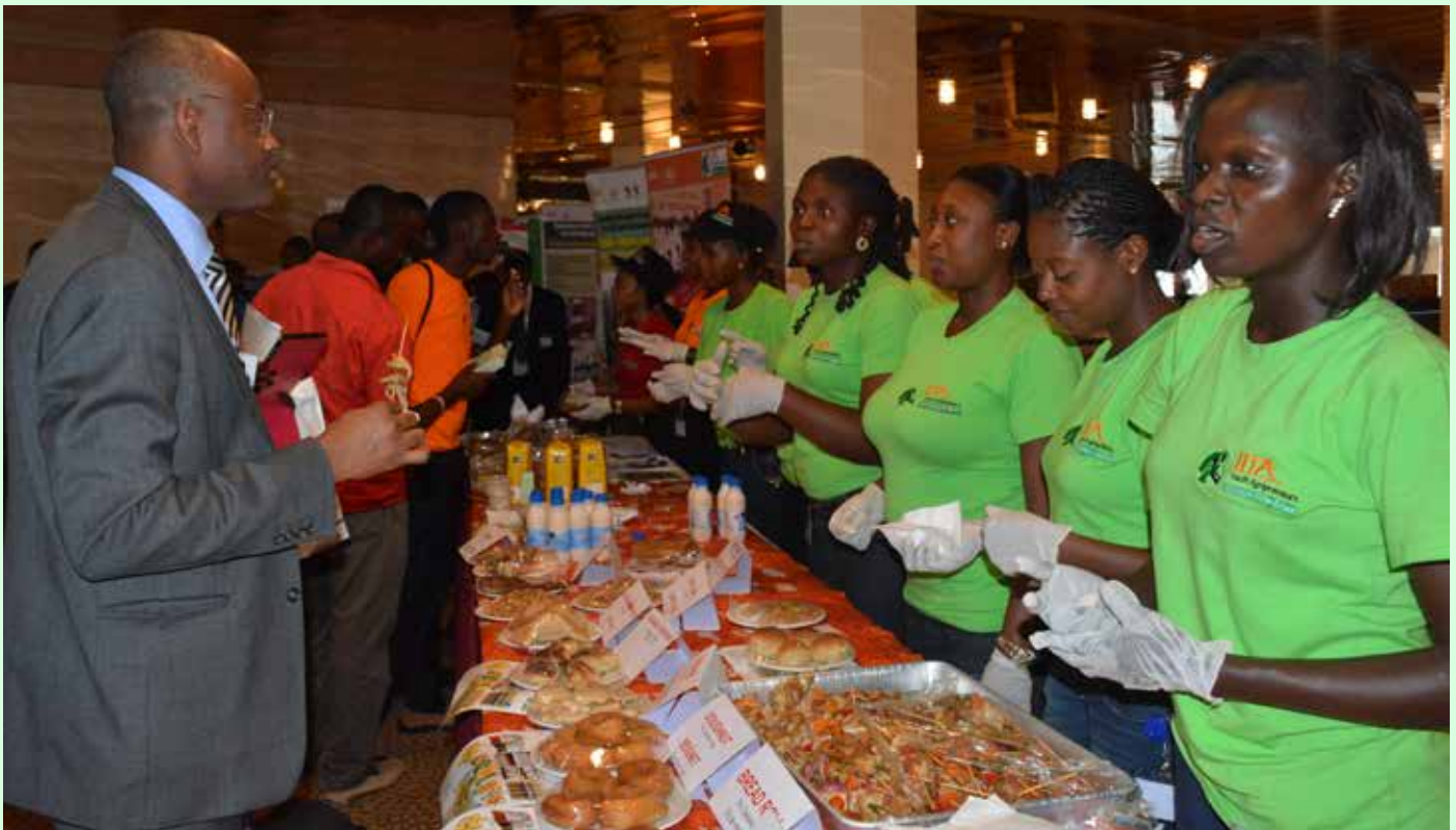
IYA displaying some of its value-added products at an exhibition in Abuja.