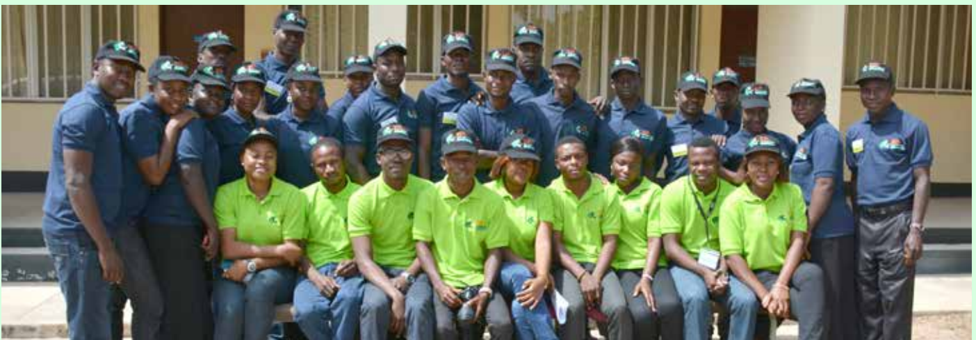
IYA (in green) with the first set of trainees under the N2Africa-to-Borno Youth Project.