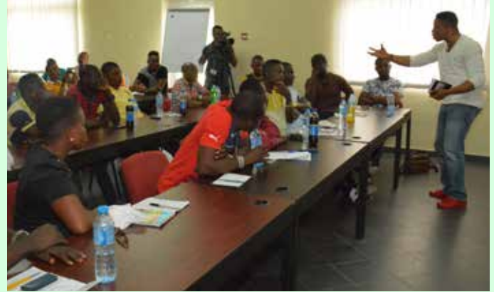
An Agripreneur facilitating classroom training for the first set of beneficiaries.