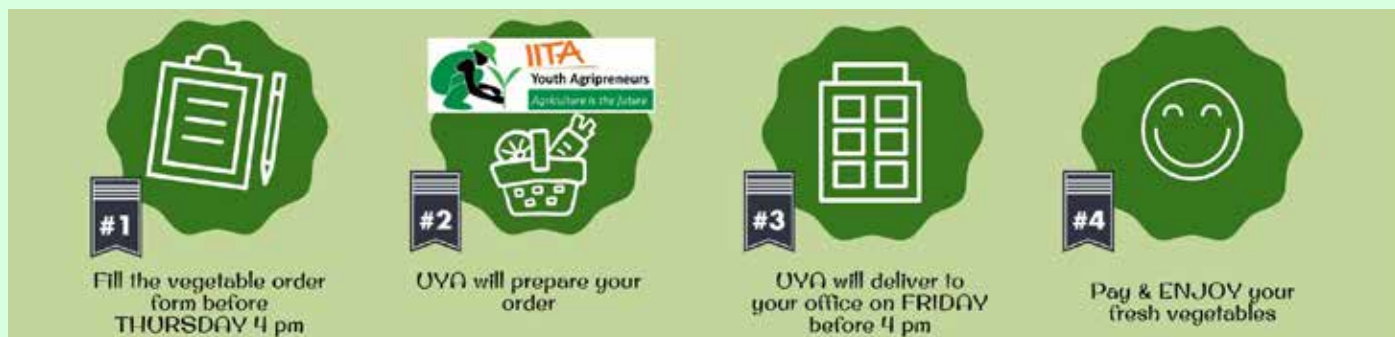
A pictorial representation of how the team in Uganda sell their produce using ICT to eliminate middlemen.