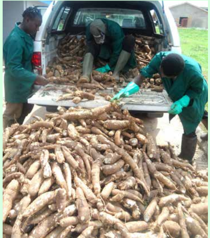
Some harvested cassava roots ready for sale.