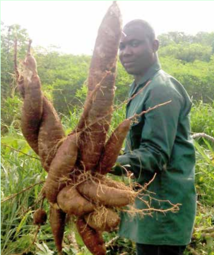
One of the cassava roots harvested from the cassava field.

Focusing on the production of quality planting material for farmers, the youth are into the production of cassava stems. They also produce cassava roots in various locations in Nigeria.