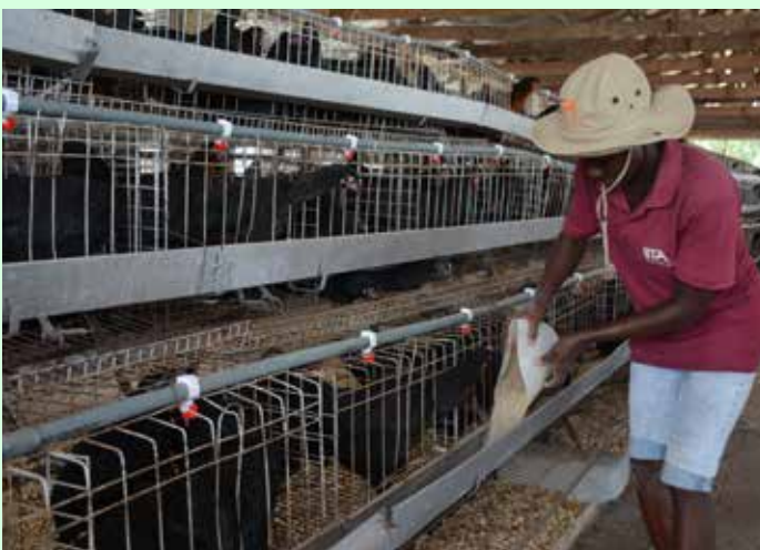
An intern trained on poultry production feeding the layer birds.