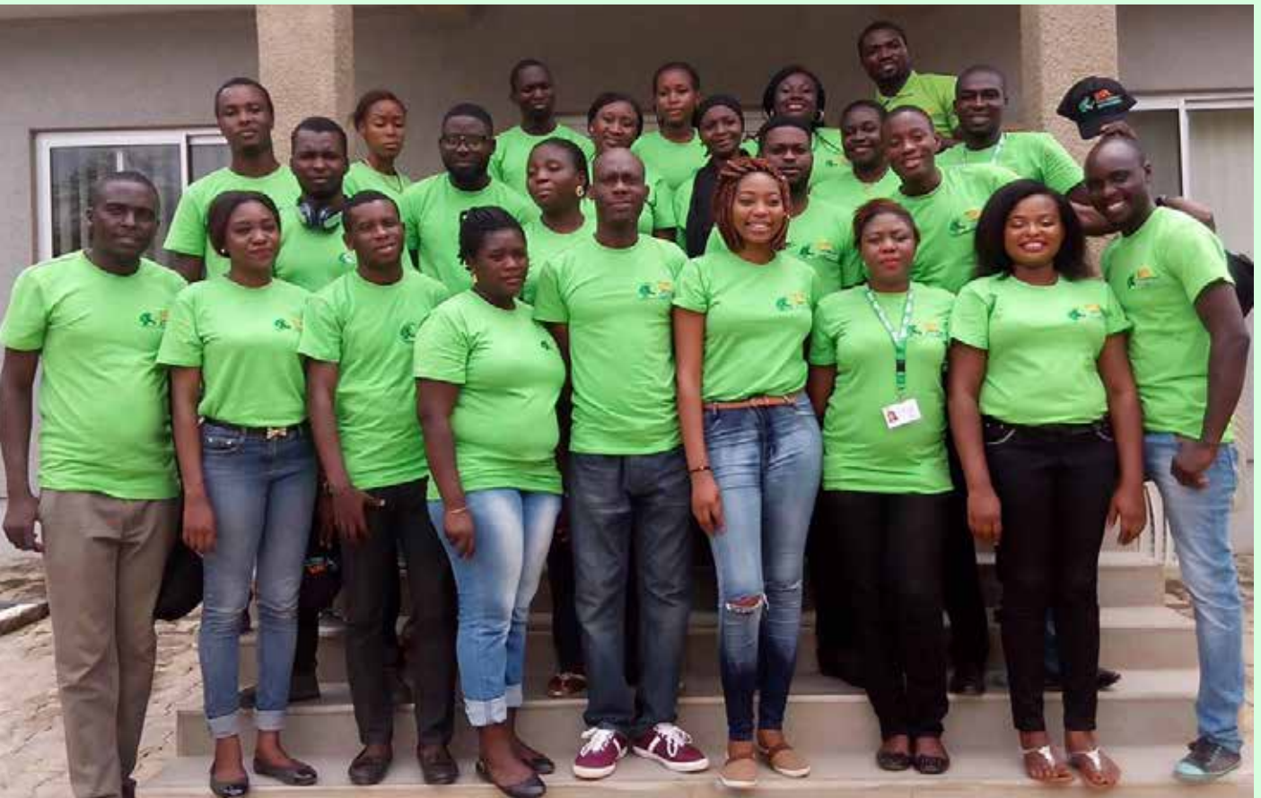
A group photograph of the IYA team in Abuja.