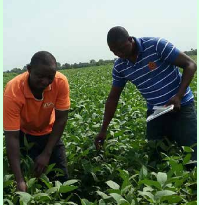
Agripreneurs taking data from the soybean field.