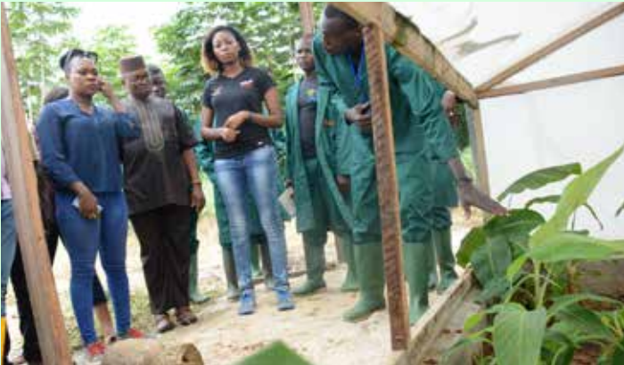
The first set of trainees of the project taking the Chevron staff on a tour of their enterprise during the evaluation visit of the team.