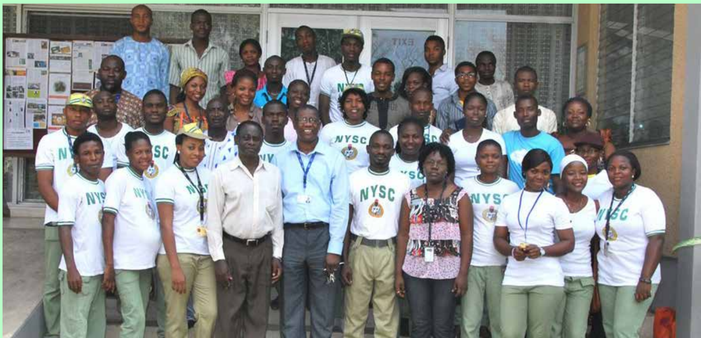
The first generation of Agripreneurs during their National Youth Service Corps (NYSC) scheme in IITA.