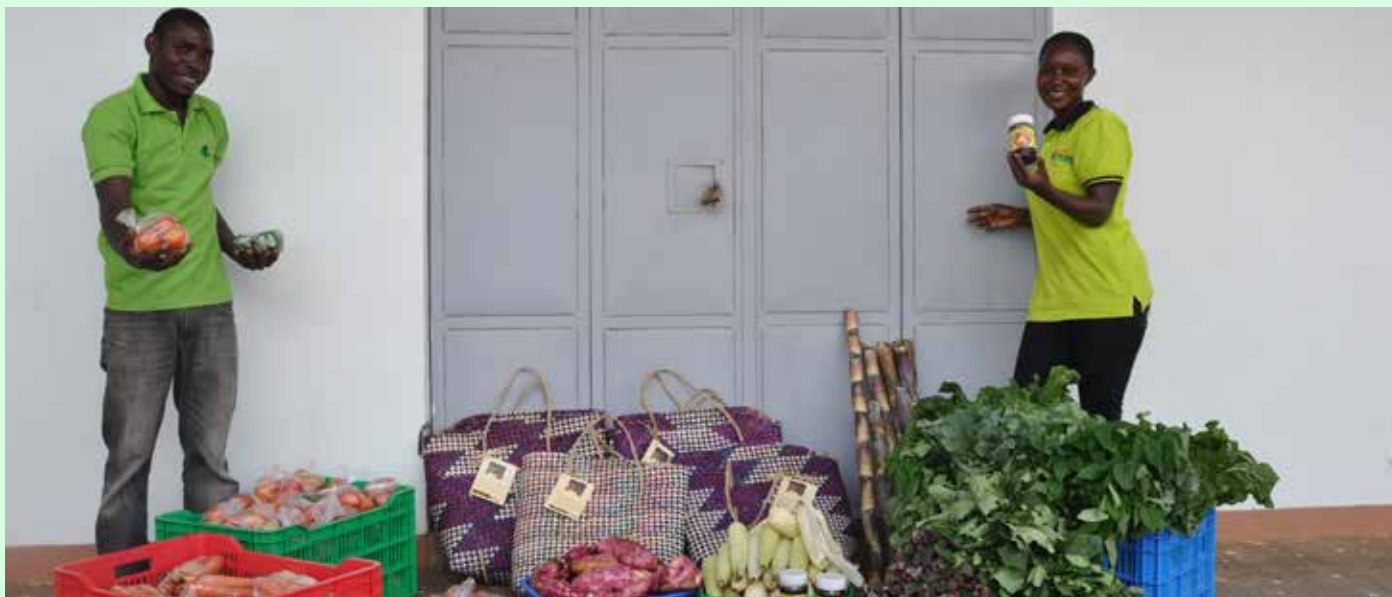
Some of the harvested vegetables ready for delivery.

The team in Uganda is known as the “WhatsApp” group. They devised an innovative means of eliminating middlemen in the sale of their vegetables through ICT. This innovation eliminated the problems faced by the youth whenever they take their produce to the market.