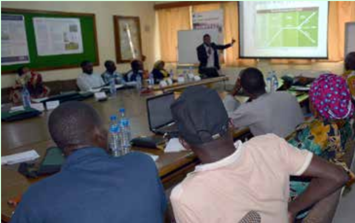
An Agripreneur facilitating classroom training for the youth in Borno State.

The project is targeted at engaging unemployed youth in Borno State in Agribusiness. IYA has recorded some business spin-offs under the project.