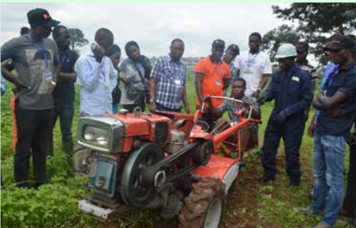
A practical session on the use of the smart tractor, Hello Tractor.