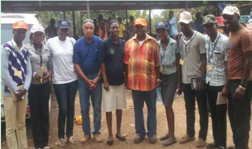
The first visit of Dr Sanginga with the IYA fish team to Durante Fish Farm in Oyo in 2014.

After intensive training at Durante Fish Farm in Oyo, the fishery team started the business with four ponds. This has now expanded to 17 ponds with a production capacity of 150 tons per cycle.