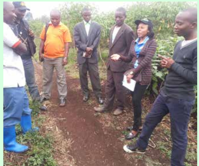
They also work with the local farmers for market linkages and distribution of new technologies.