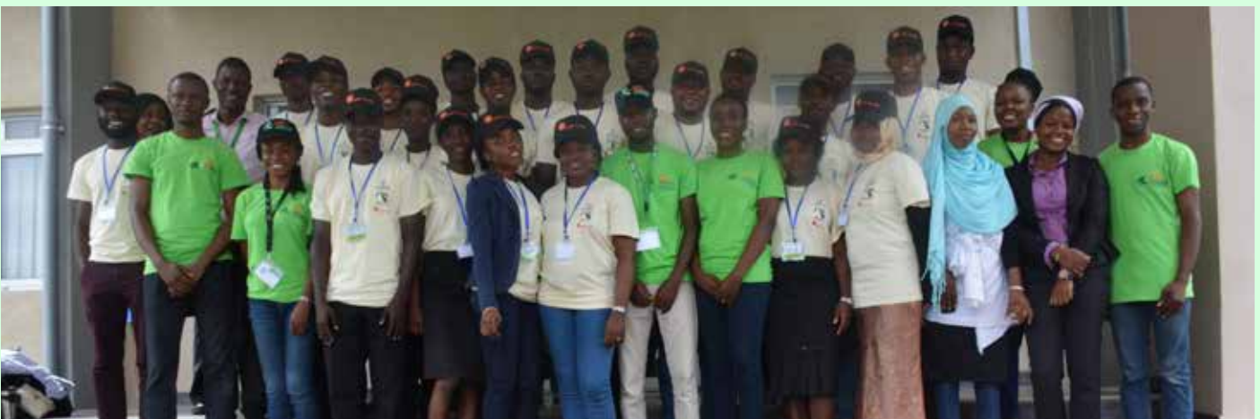
A group photograph of the first set of trainees under the project.