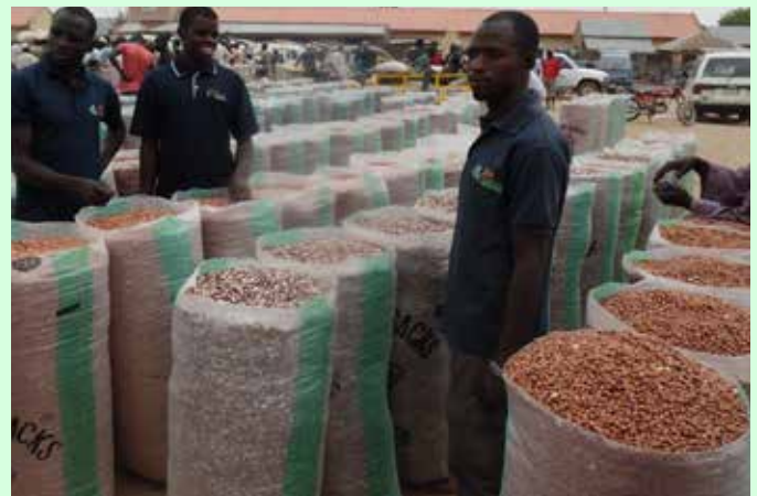
Some of the beneficiaries of the training display their commodities for sale.