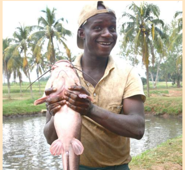
An Agripreneur shows off a catfish caught from the Agripreneurs' pond