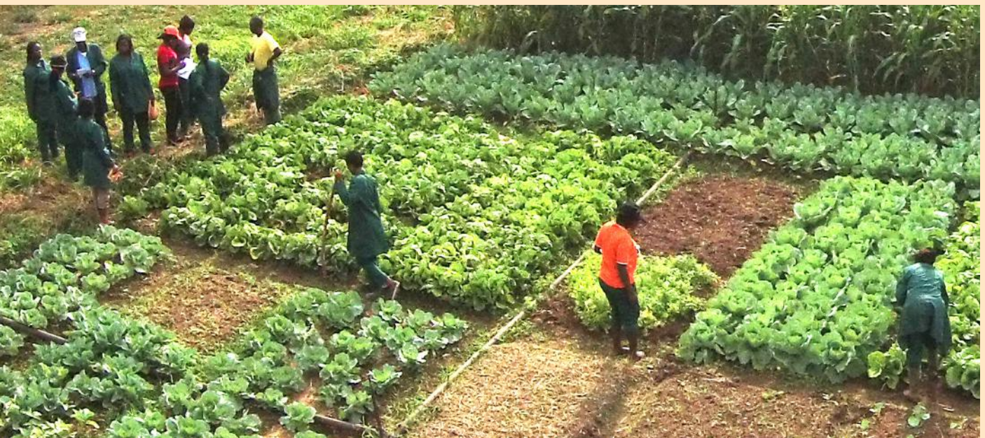
An aerial view of the Agripreneurs working on the vegetable field captured with a sophisticated Dji Drone Camera (Phantom 2+)