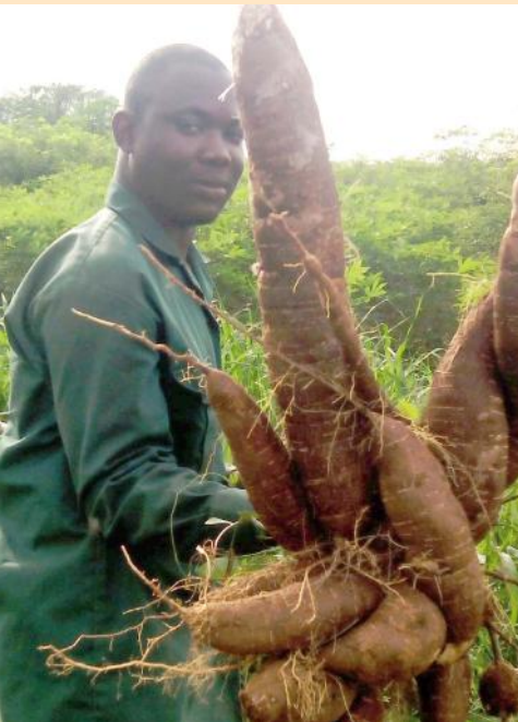
An Agripreneur with cassava tubers harvested one of IYA's cassava fields