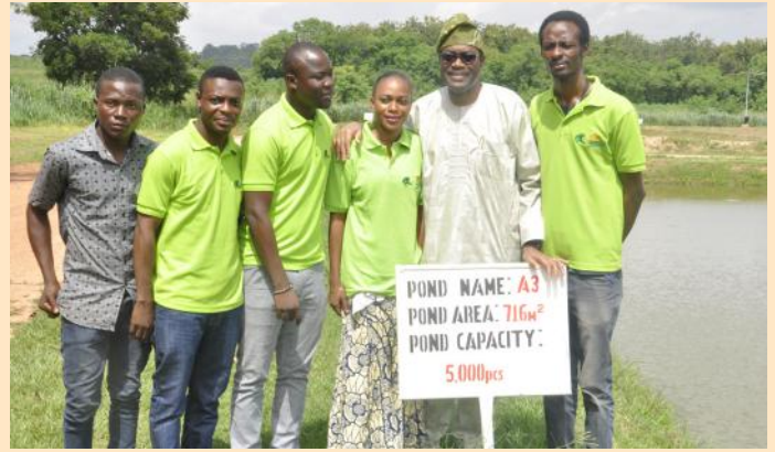
AfDB president, Dr Akinwumi Adesina with the Agripreneurs at the IYA fish pond