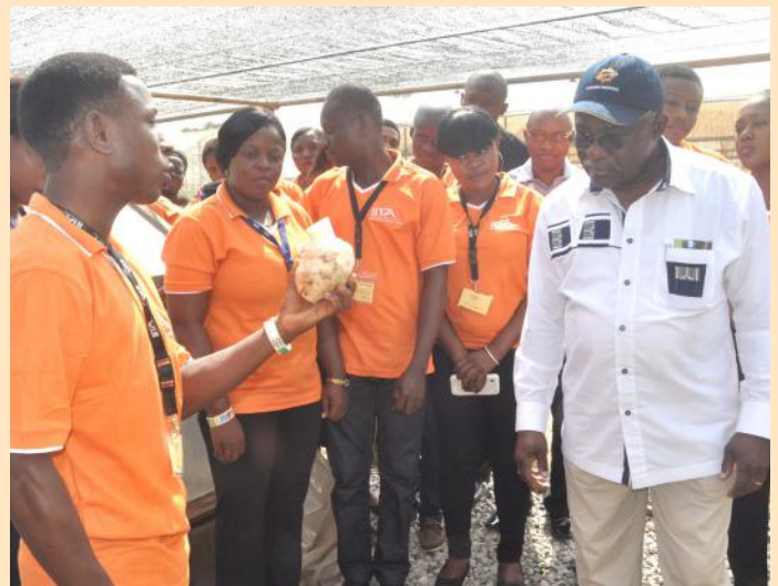
IFAD President, Dr Kanayo Nwanze at the Agripreneurs' screenhouse used for producing plantain suckers