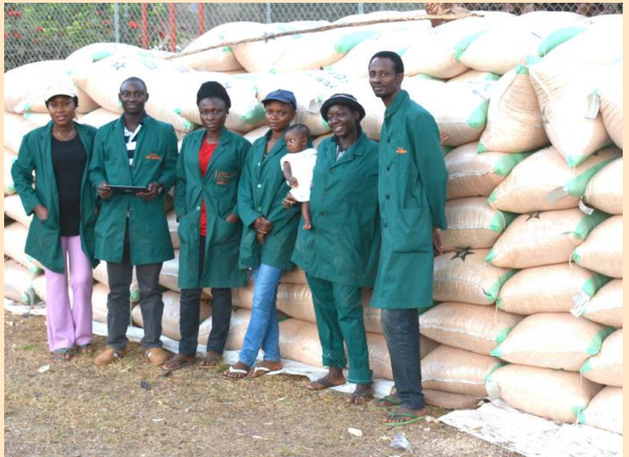
Agripreneurs standing in front of harvested bags of maize and soybean