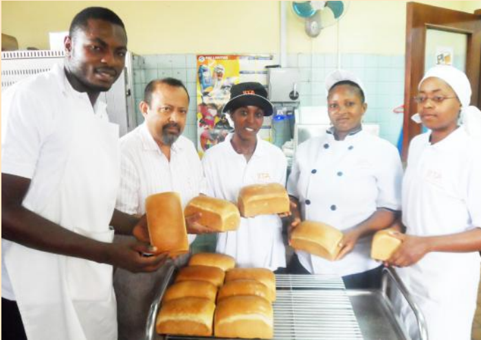
Agripreneurs baking cassava bread