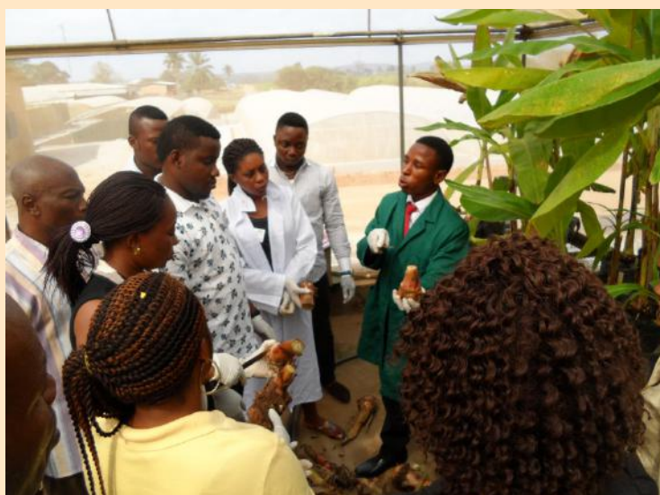
On-field training of the youth