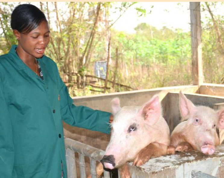
An Agripreneur tending to pigs