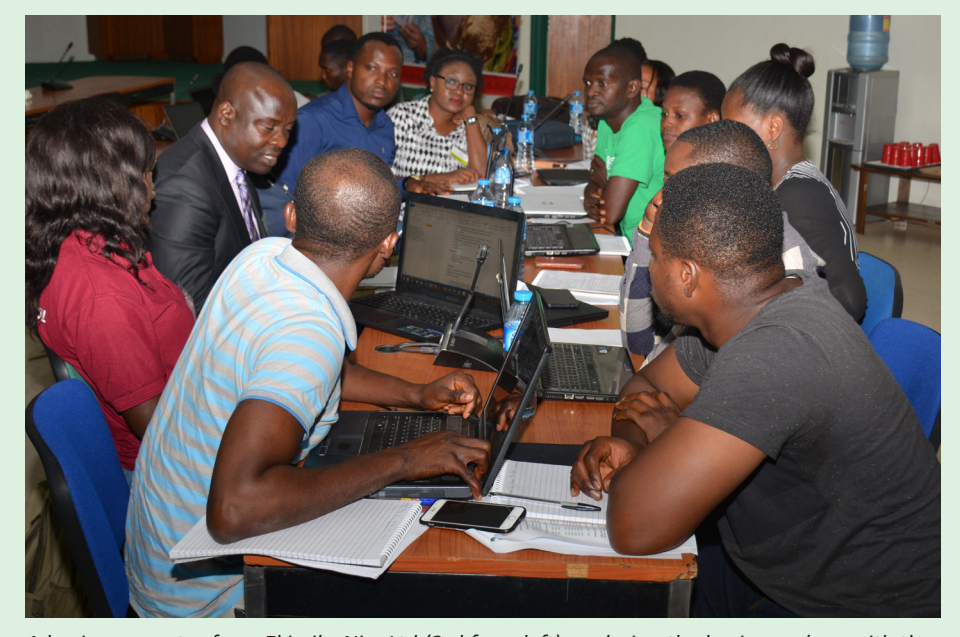
A business mentor from Ekimiks Nig. Ltd (3rd from left) analysing the business plans with the youths at the implementation workshop

agribusiness incubation, Through IYA will be applying its experiences and training tools to engage 7 new agripreneur groups in 7 countries. The project will establish a system agribusiness orientation mentorship in support of these actions. Each of the incubation centers shall consist of 12-20 or more interns at any time and they will be divided into subgroups with their own value chain preferences and task assignments. These facilities also operate as technology and innovation centers for young people on specific commodity value chains and in response to directed needs of TAAT.