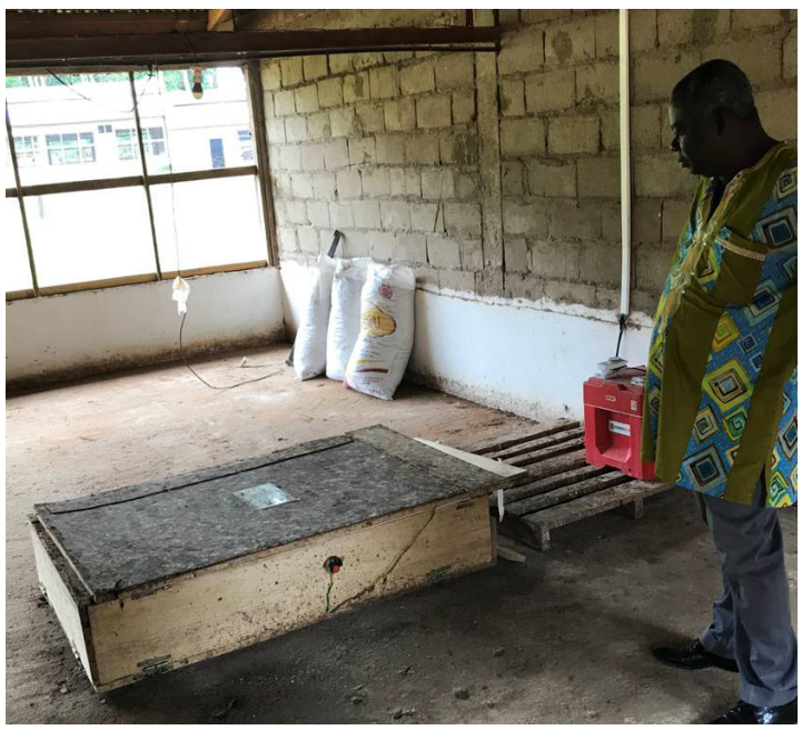
Commercial incubation and chick production occurs at the Obala school (left) but many poultry houses remain underutilized, suggesting opportunity for developing a poultry agribusiness park (right).