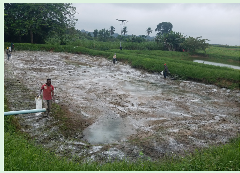
Liming of the pond in preparation for stocking of catfish fingerlings for the food basket