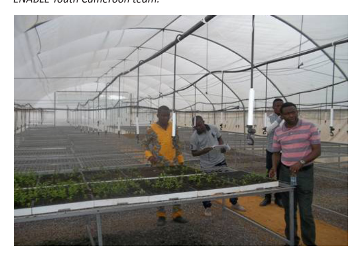
An underutilized greenhouse suitable for large-scale seedling production