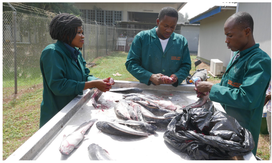
The Frotchery team during their incubation program at IYA

Frotchery Farms Limited is one of the foremost spin-off enterprises recorded in the history of the IITA Youth Agripreneurs (IYA). The business is co-owned by three young graduates who were recruited as part of the Greenwealth Agripreneurs- the first set of young people who were trained under the incubation program of IYA for 18 months. The business partners were into catfish production and processing while undergoing training with IYA.