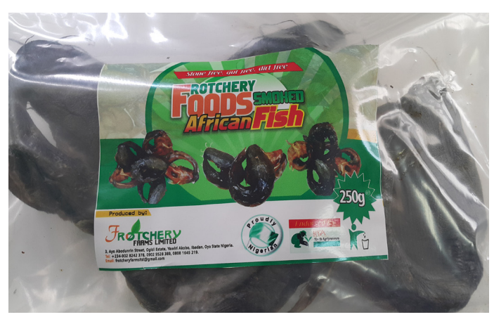
A sample of the branded smocked fish from Frotchery Farms