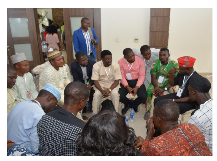
The members of the cooperative at a meeting during the 2018 Agtech conference in Abuja

The project which was funded by USAID officially ended in July 2018.