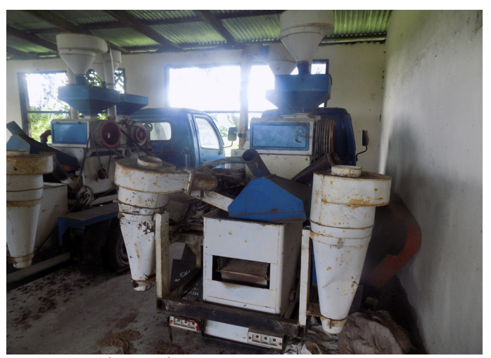
An abandoned feed mill facility