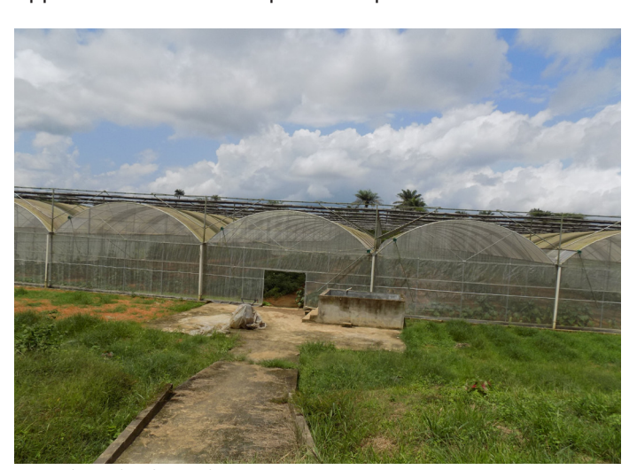
An under-utilized greenhouse

The country is also finalizing plans to commence the ENABLE Youth Program.