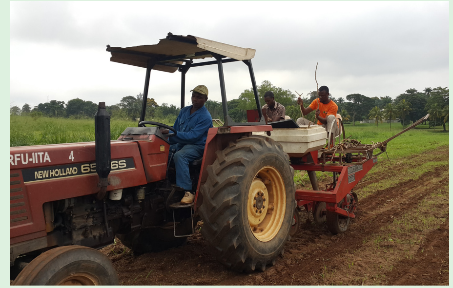
Agripreneurs in Ibadan, Nigeria planting the cassava field for food basket

The varieties planted include TME 419, TMS 505 and 593 for cassava, PVA SYN 2 and 13 for maize. Nutrition outreach will be conducted among all of the Agripreneur youth groups with a targeted impact of about 20,000 persons.