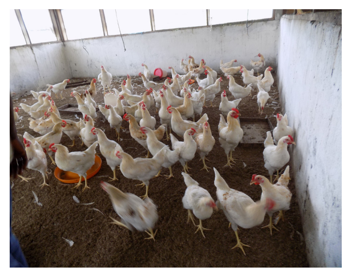
The poultry facility in one of the incubation centers