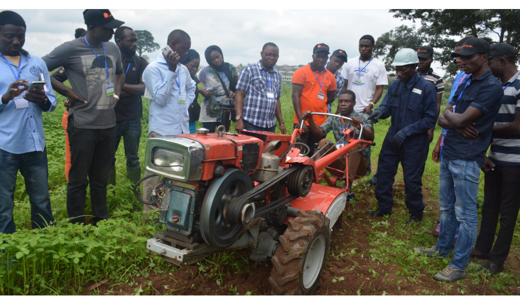
Training of youths on the use of the smart tractor

Using a farm estate platform known as smartfarm.com.ng farmers who are interested in farming but do not have the technical know-how subscribe to the platform where they can get access to land, professional managers and market for the produce. They