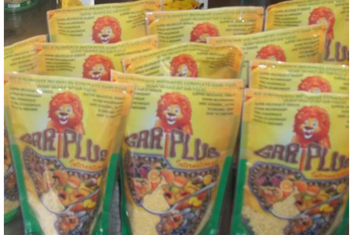
Youth display their food products produced by Yariland at Mbolmayo where plans to upscale production and diversify services were discussed with the ENABLE Youth Cameroon team.