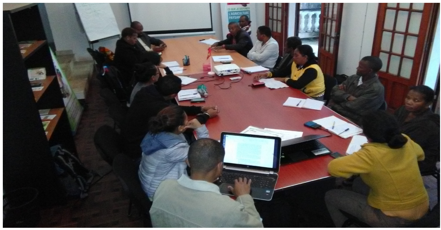
The team meets with value chain actors in Tamatave Region

As the ENABLE Youth program continues to gain prominence in Madagascar, the private sector actors in the country have committed to support the initiative in the country. The program which is an initiative of the African Development Bank (AfDB) is being implemented by the Ministry of Agriculture with technical support from IITA and it aims at creating youth employment through agribusiness ventures.