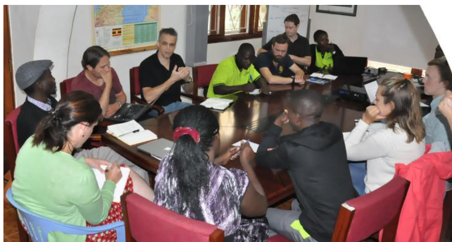
The IYA Uganda and SLU team during a round table discussion on ways of enhancing agribusiness

Building on the existing partnership with IITA, the Swedish University of Agriculture (SLU) is exploring areas of partnership with the IITA Youth Agripreneurs in Uganda on the youth agripreneurship program with some identified tertiary institutions in the country.