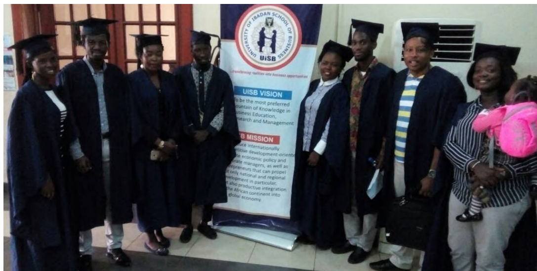
Some members of IITA Youth Agripreneurs who are among the pioneer students of the MBA class

The pioneer students for the Masters of Business Administration (MBA) in Agribusiness at the University of Ibadan School of Business (UISB) matriculated on Saturday, 22 July for the 2016/2017 academic session.