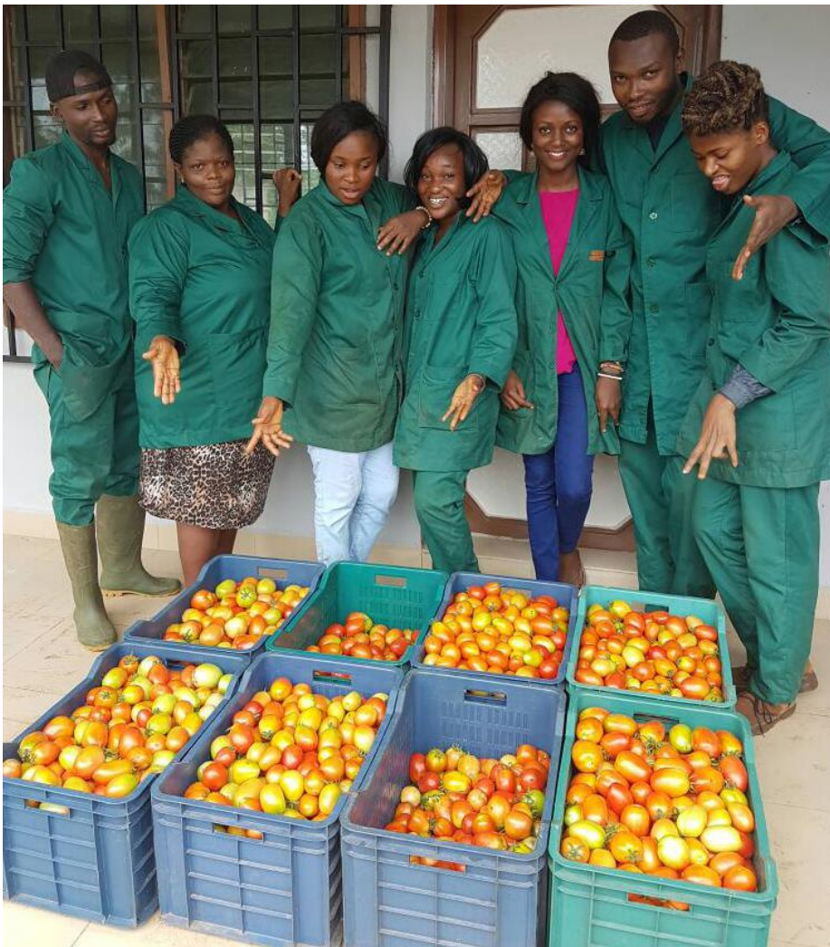
Crates of harvested tomatoes from the greenhouse

chains of poultry, fishery, horticulture, cassava, and soybean.