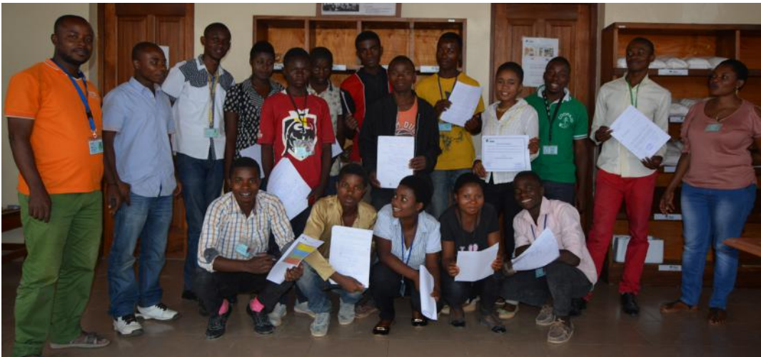
The trained outgrowers displaying their certificate

for the production of maize grain and trained 50 young rural maize farmers in the production of disease-free maize grain.