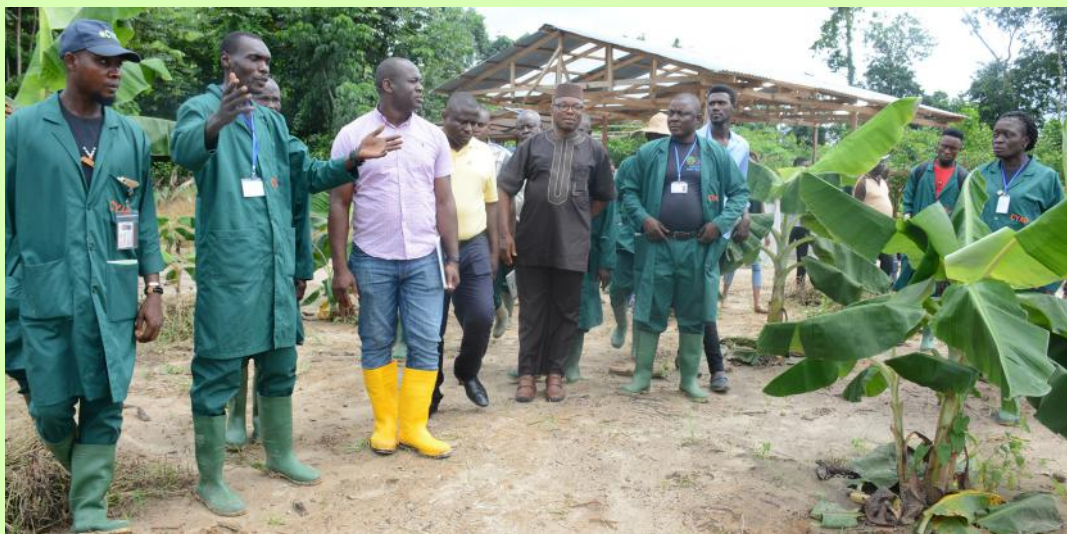
CYAG youths with officials of Chevron Nigeria Limited at their plantain field in Itshekiri kingdom

Chevron Nigeria Limited (CNL) has stated that they are impressed by the impact created so far by the Community Youth in Agribusiness Group (CYAG) project which is currently running in the Niger Delta region of Nigeria.