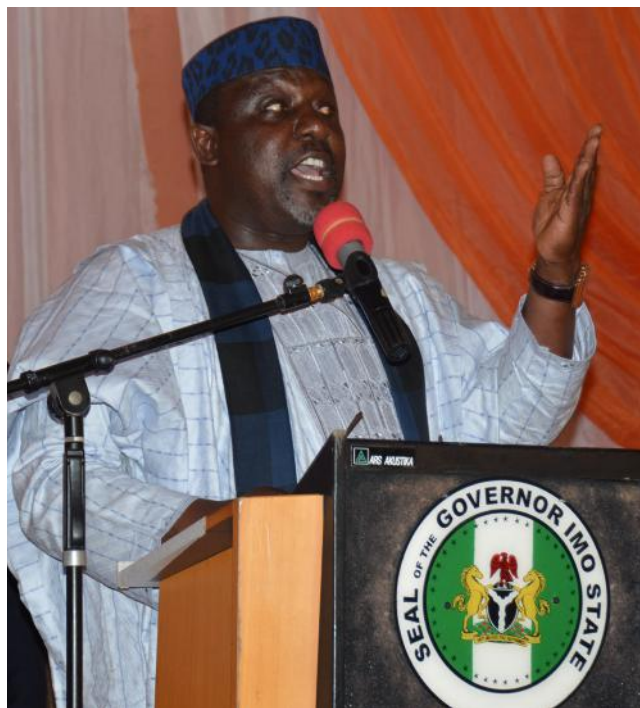
Governor Owelle Rochas Okorocha

Imo State Governor, Owelle Rochas Okorocha expressed the willingness of the State to partner with IITA in ensuring that the youth in Imo State benefit from the youth in agribusiness initiative championed by the institution.