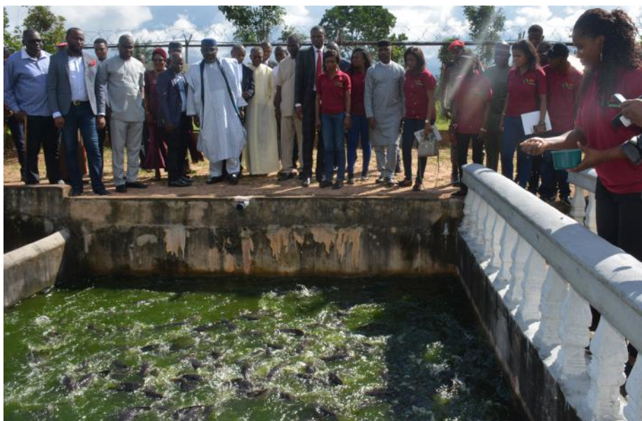
Governor Owelle Rochas Okorocha visits one of the fish ponds established by the Imo team