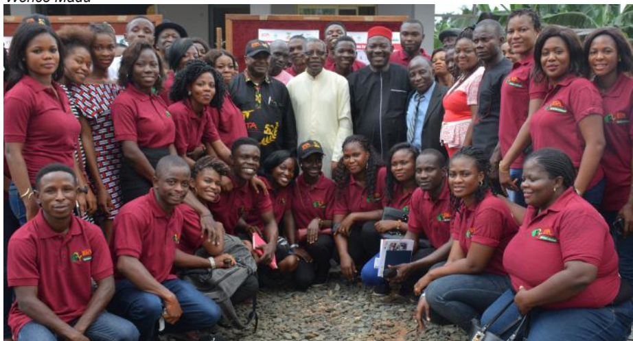
IITA Youth Agripreneurs-Imo with staff of IITA and Imo State Polytechnic