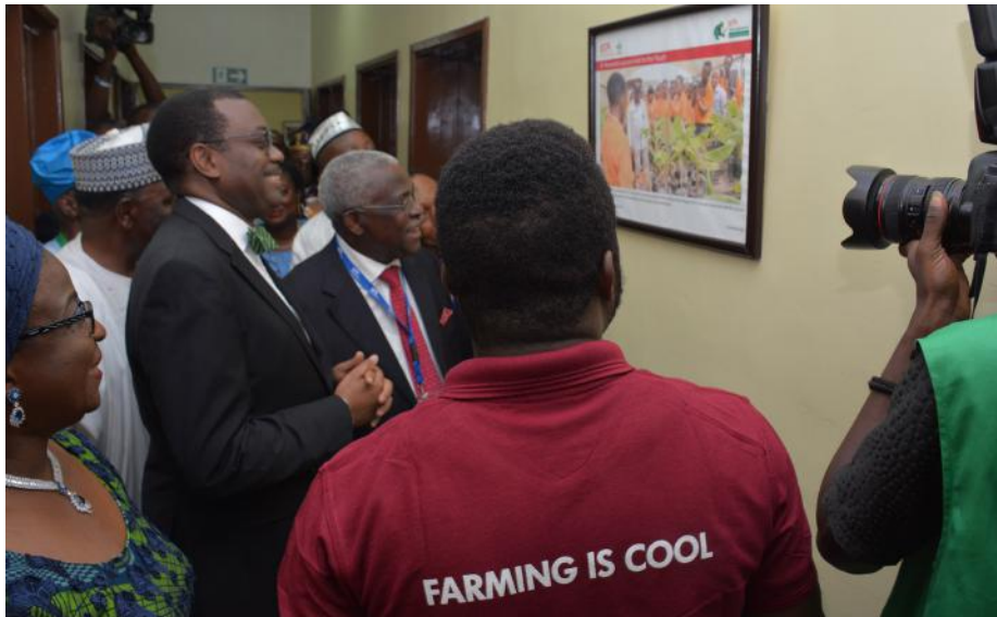
Poster presentation by Youth Agripreneurs inside the building