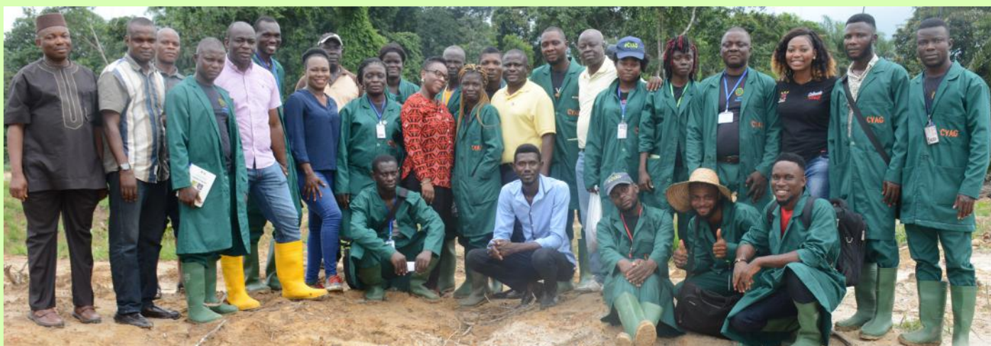
A group photograph of CYAG Youths with delegates from Chevron Nigeria Limited

After the incubation program, the youth will develop business plans and set up enterprises along their value chains of interest.