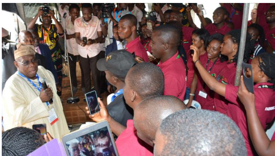
General Olusegun Obasanjo addressing the Youth Agripreneurs