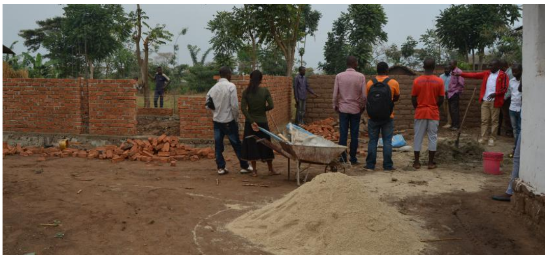
Construction ongoing at the site of the factory in Kamanyola

This partnership is expected to increase the production capacity of IKYA from 7 tons to 25 tons per week and expand the