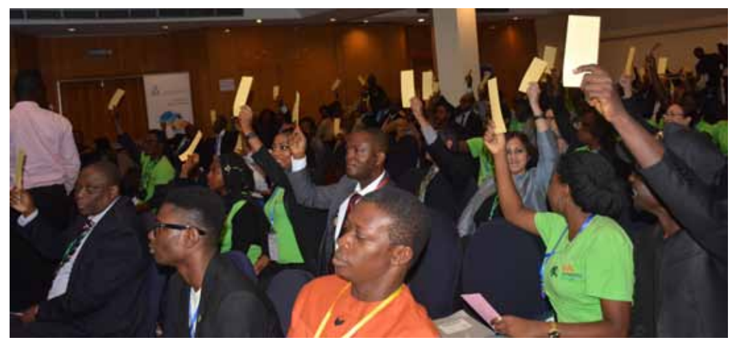
Participants at the session cast their votes

In a session dedicated to youth entrepreneurship in agriculture at the 2016 Africa Economic Conference in Abuja, the IITA Youth Agripreneurs in Nigeria thrilled participants and other stakeholders present during the session.