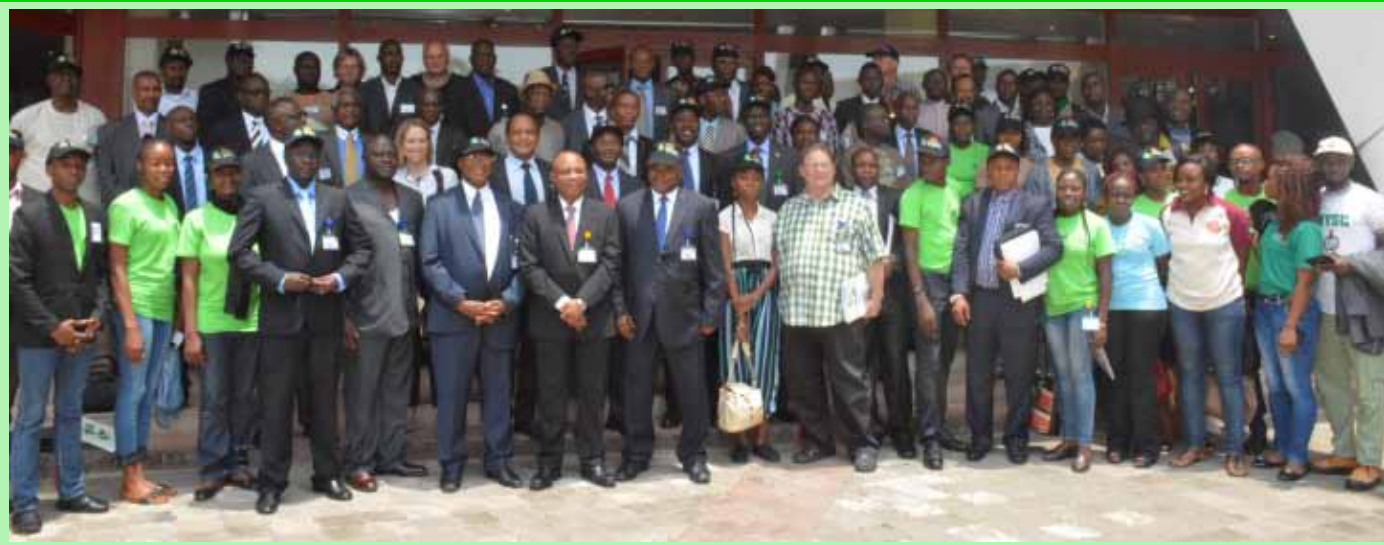
Participants at the ENABLE Youth Workshop