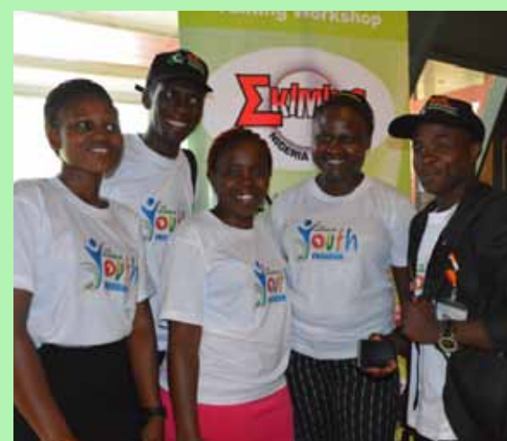
Agripreneurs from East Africa