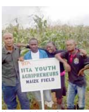
Youths on their maize farm

To address the challenge of poor quality seeds, members of the IITA Youth in Agriculture have cultivated 12 hectares of improved