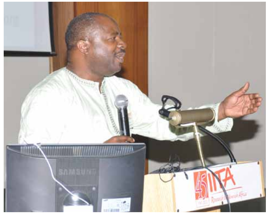
IITA DG, Dr Sanginga addressing youths in Ibadan

Among the challenges facing sub-Saharan Africa is the spiralling rate of unemployment among the growing youth population. Reports from the Africa