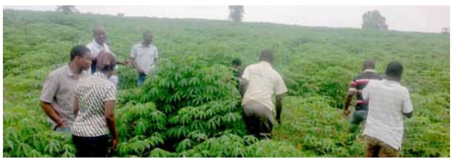
IITA Agripreneurs on a learning visit to Niji Farms

IITA Agripreneurs who visited the farm testified that the farm is a perfect example, demonstrating that agriculture indeed pays off.