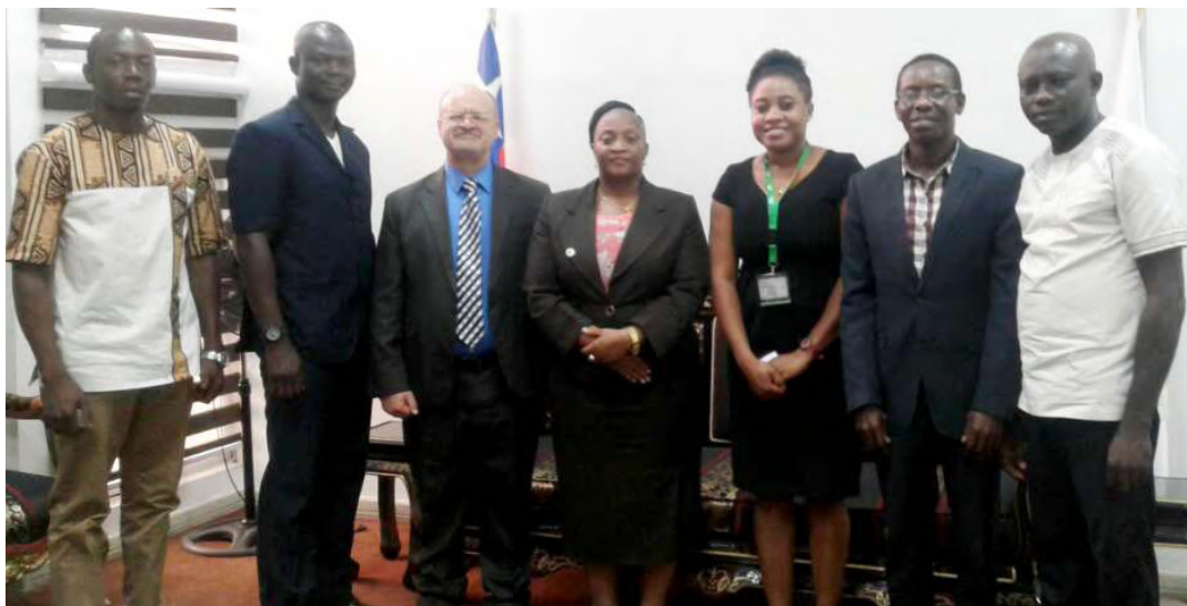
IITA staff with Madam Jewel Cianeh Howard Taylor (center), the Vice President of the Republic of Liberia

cassava processing centers in strategic regions of the country.