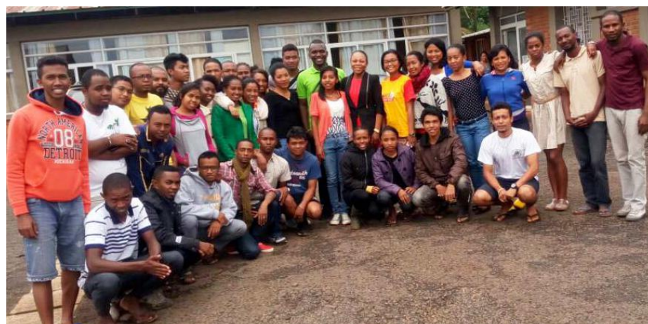
A photo session of trainees