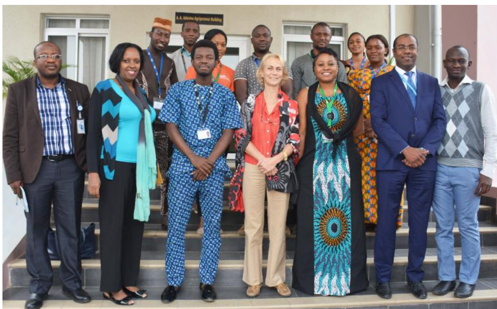
The team from WFP and IITA Youth Agripreneurs

The World Food Program (WFP) has indicated interest to partner with the IITA Youth Agripreneurs in empowering displaced young people in the north-eastern part of Nigeria.