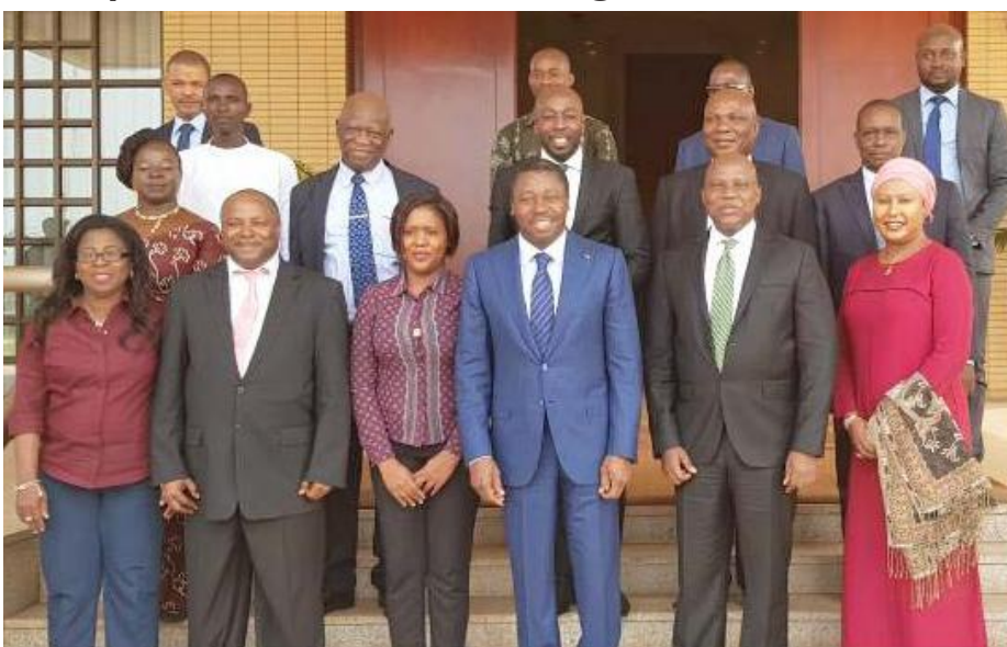
The President of Togo, Faure Gnassingbe with IITA and AfDB representatives

The IITA Youth Agripreneurs is working on a plan that will create gainful employment for young unemployed