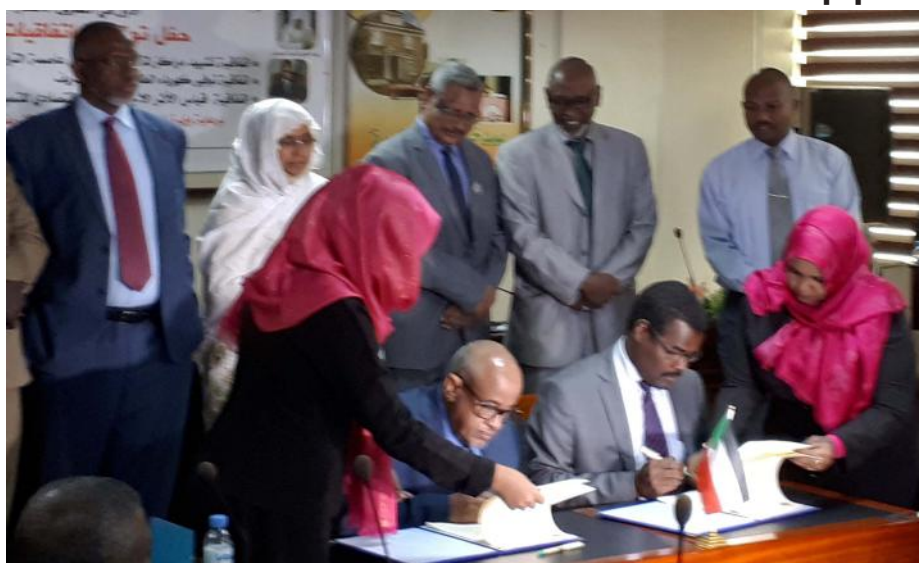
Signing of agreement with the Savings and Social Development Bank

The state governments of River Nile, Gedaref, and Kassala in Sudan have expressed enthusiasm and commitment to be core drivers of the ENABLE Youth program in their respective states.